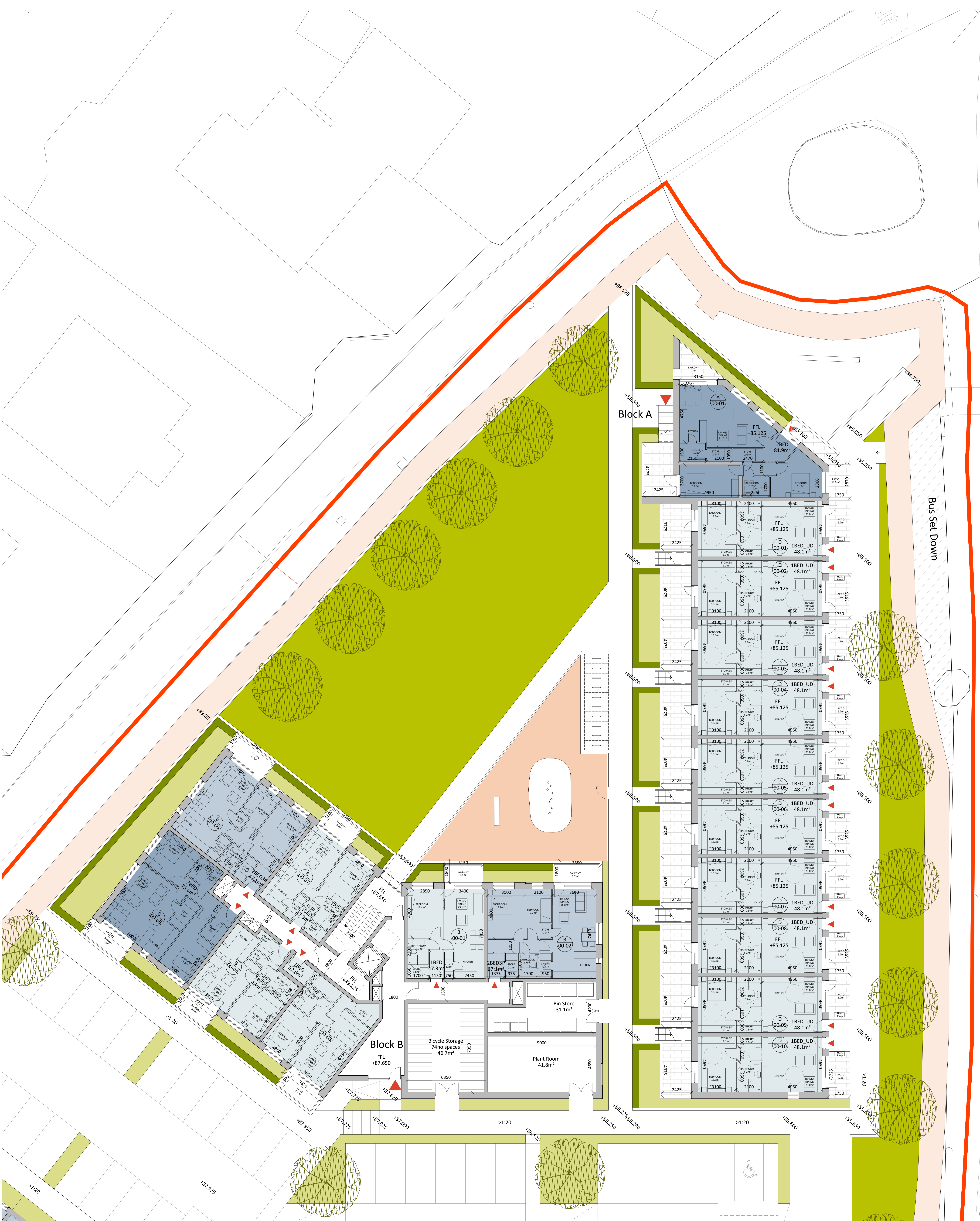
Proposed Block A & Block B Level 00 Plan