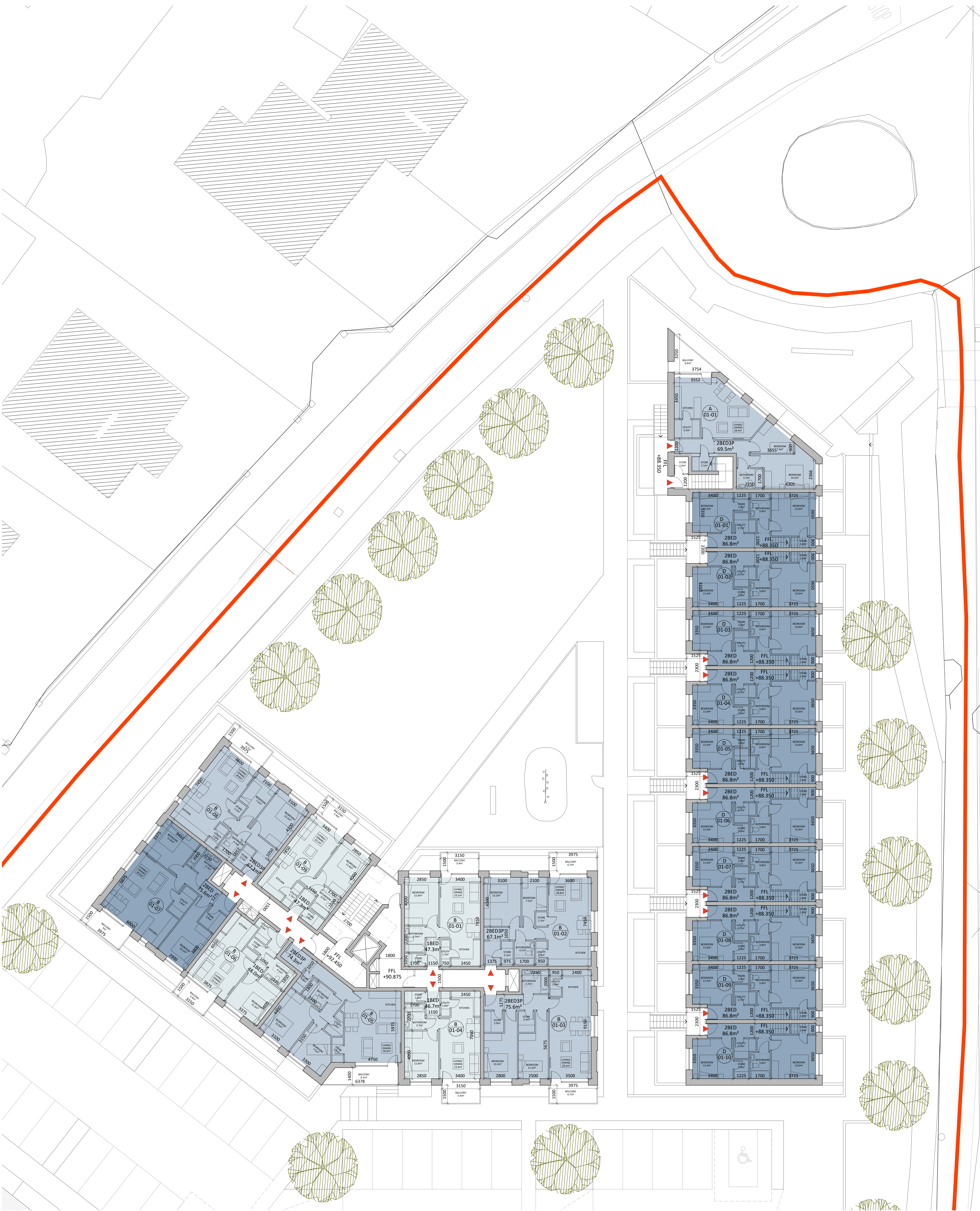
Proposed Block A & Block B Level 01 Plan