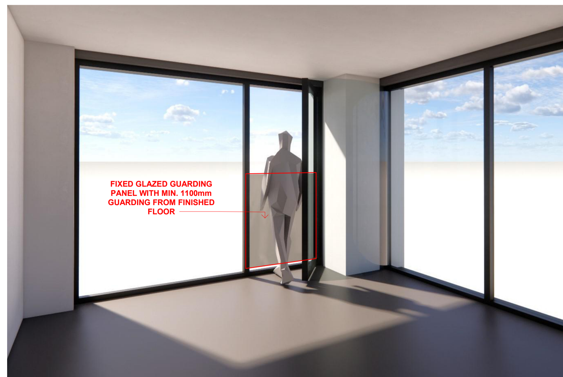
Typical Juliet Balcony - Internal View 01