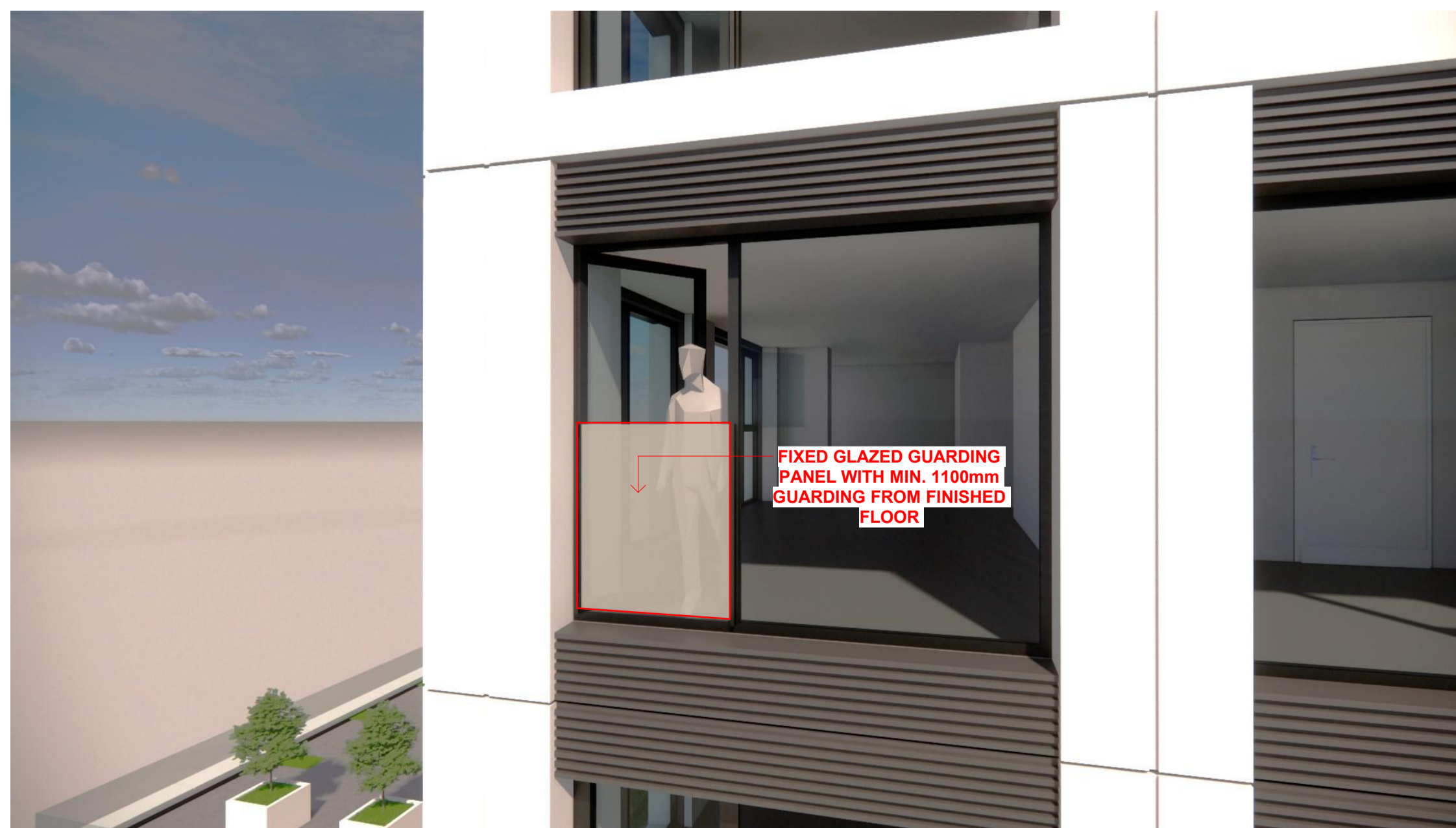
Typical Juliet Balcony - External View 01