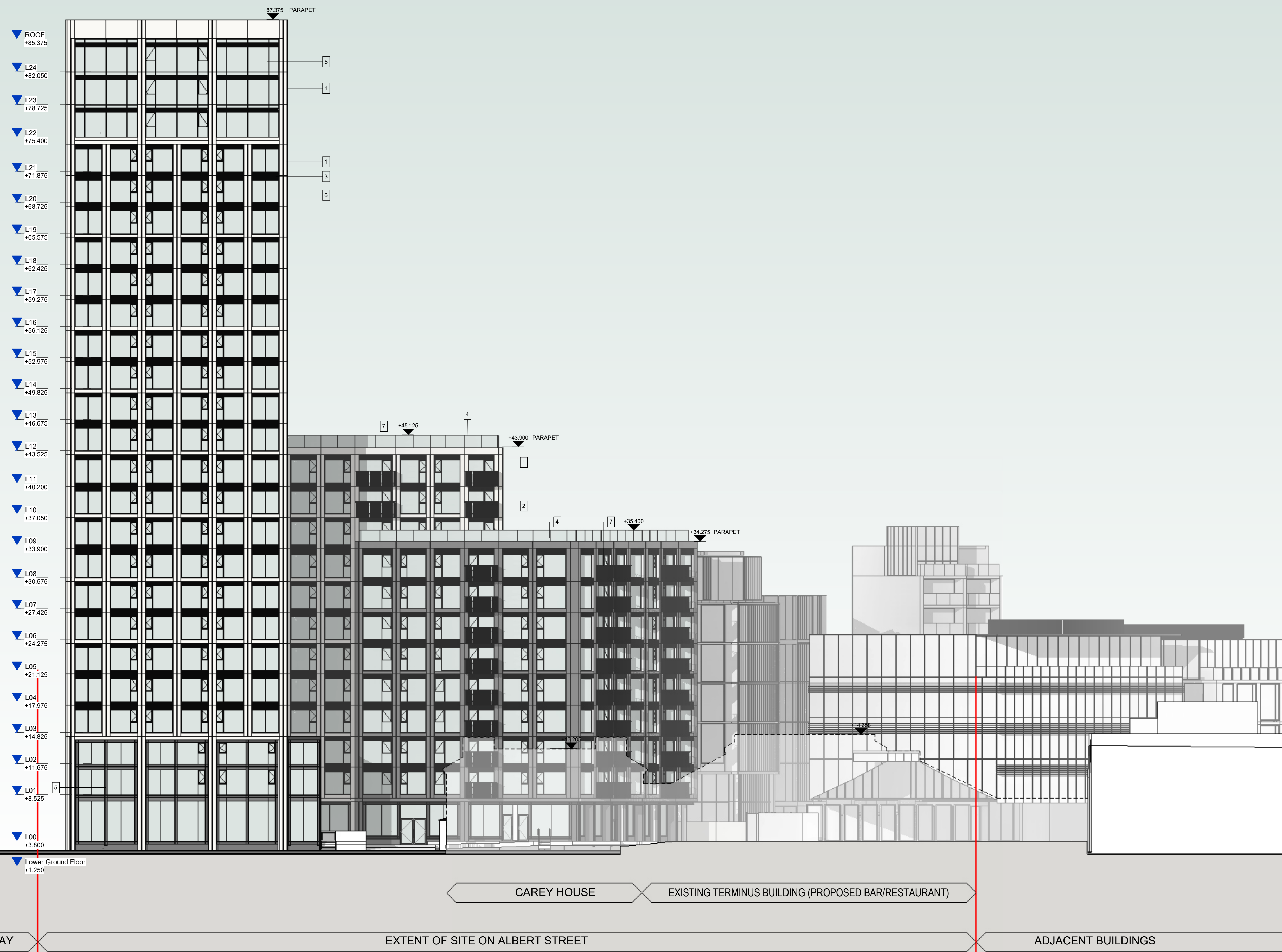
1 WEST ELEVATION (ALBERT STREET) 1 : 200

Architecture • Interiors henryjlyons.com +353 21 422 2002 info@cork@henryjlyons.com cork, T12 X8N6