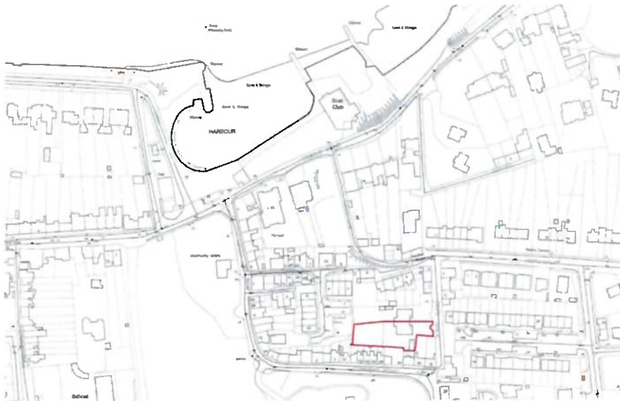
Fig. 2 above is the site in the context of the OSI 1:1000 Urban Place Map (Not to scale)