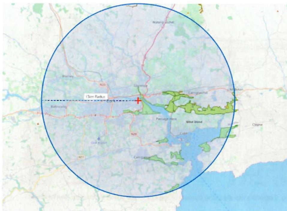
Fig. 4 above is a map showing the site in red with a 15km radius around and the SPA / SAC indicated