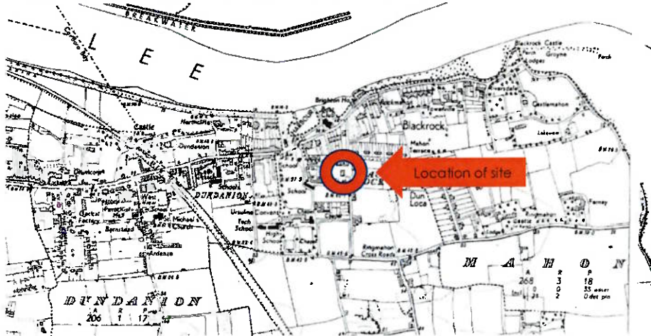
Fig. 1 above is the site in the context of the OSI 1:10560 Record Place Map (Not to scale)

In support of this report is a map highlighting the site and its distance from the SPA & SAC in question. This can be found in the Appendix. This Appropriate Assessment Screening therefore concludes that the proposed development would not be likely to have a significant effect on any Natura 2000 site.