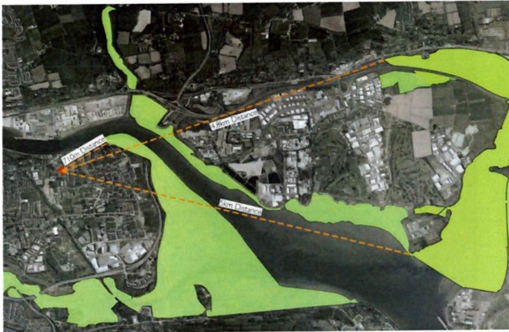
Fig. 4: Base map above is taken from EPA web portal edited by author. Indicates the Cork Harbour SPA & Great Island SAC. Available: https://gis.epa.ie/EPAMaps/ Larger image of the above appended to this report.

For further information relating to the proposed works, please refer to the Architects Design Statement accompanying this application.