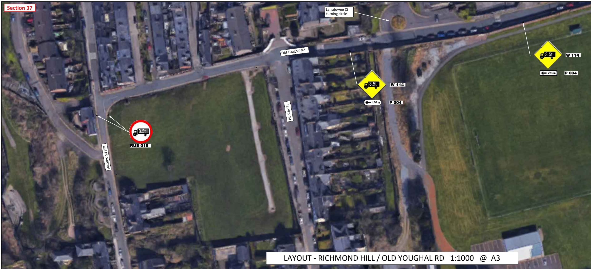
LAYOUT - RICHMOND HILL / OLD YOUGHAL RD 1:1000 @ A3