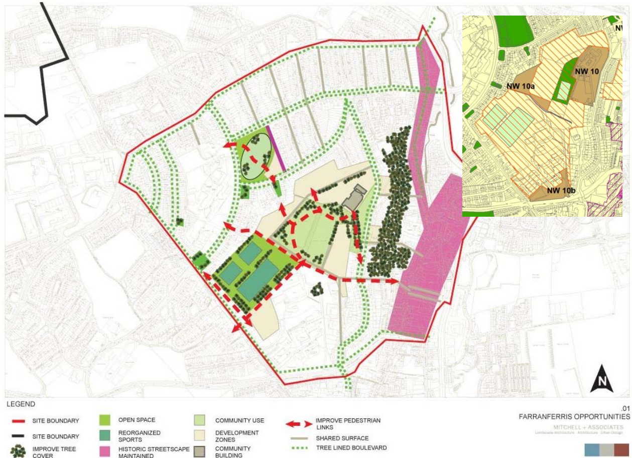
FIGURE 2: FARRANFERRIS CONCEPT MAP FROM CCLS 2008 SHOWN WITH AN EXTRACT FROM THE CCDP 2015

However, we consider that given the national targets set for urban growth, the lands at Farranferris have significant potential to aid in the achievement of the ambitious growth targets set for the city in the NPF and RSES. The approach to zoning and landscape protection in the city needs to further evolve and make appropriate use of brownfield/infill land in order to meet the demands and needs of the growing population, to safeguard economic, physical and social growth.