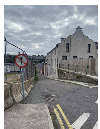
02. View of Existing Gerald Griffin Ave junction.