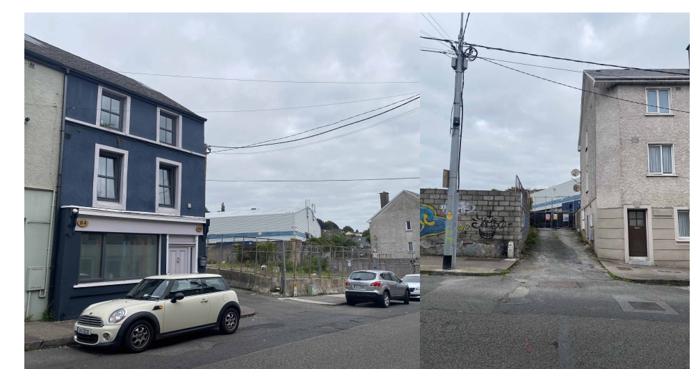
03. View of existing Gerald Griffin Ave junction and Gerald Griffin St.