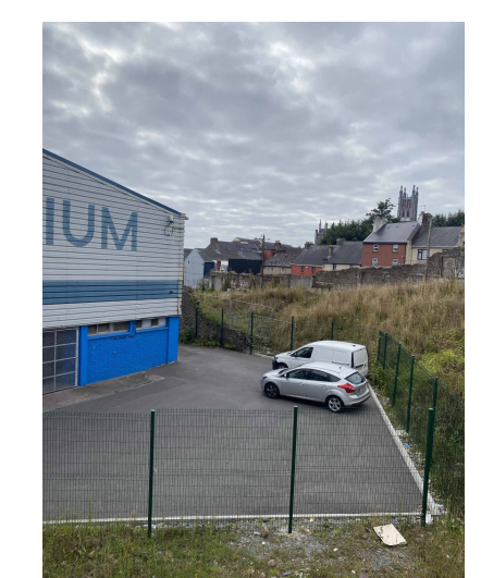
01. View of existing the