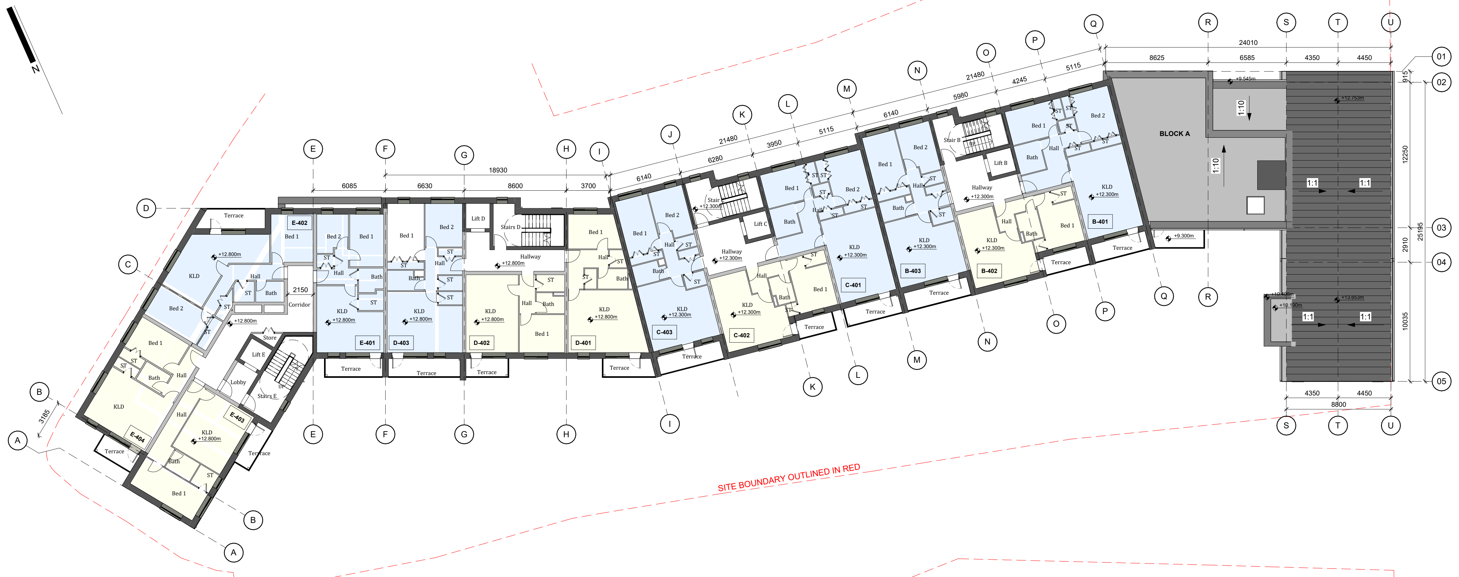
1 Level 04 Floor Plan 1 : 200