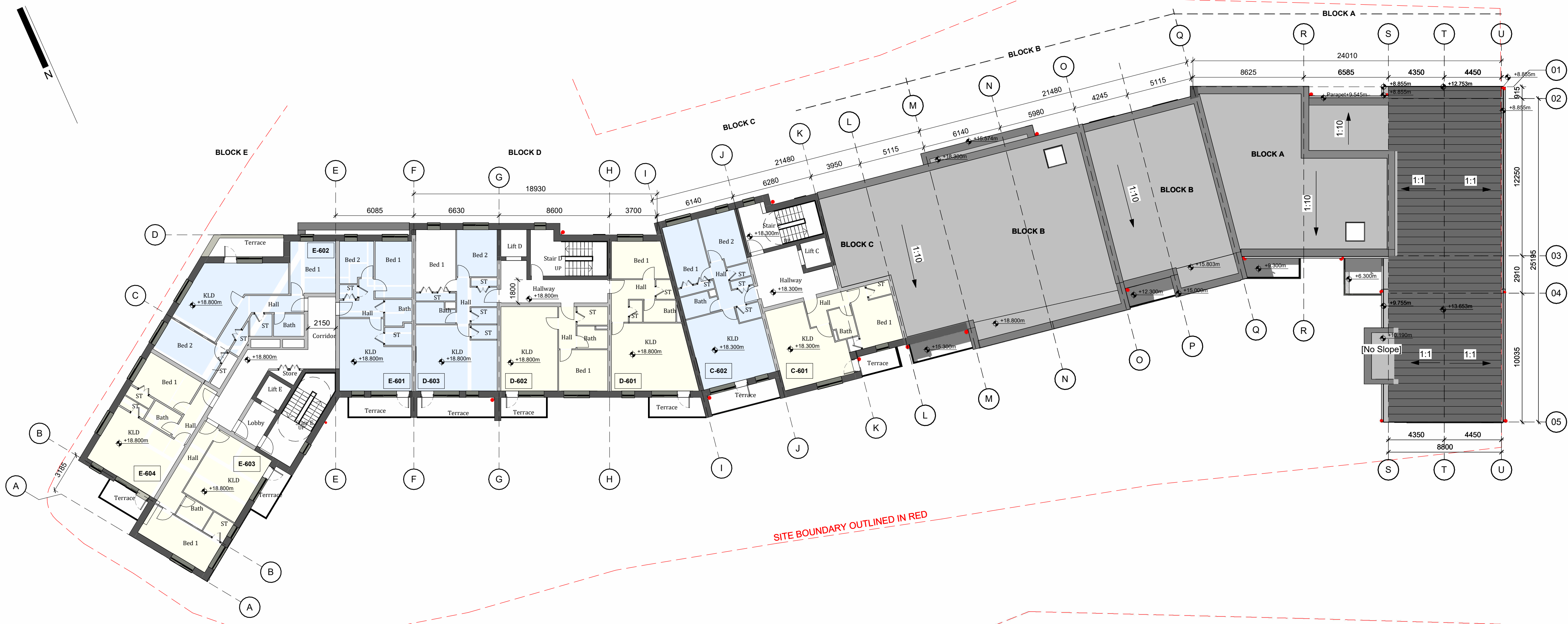
1 Level 06 Floor Plan 1 : 200