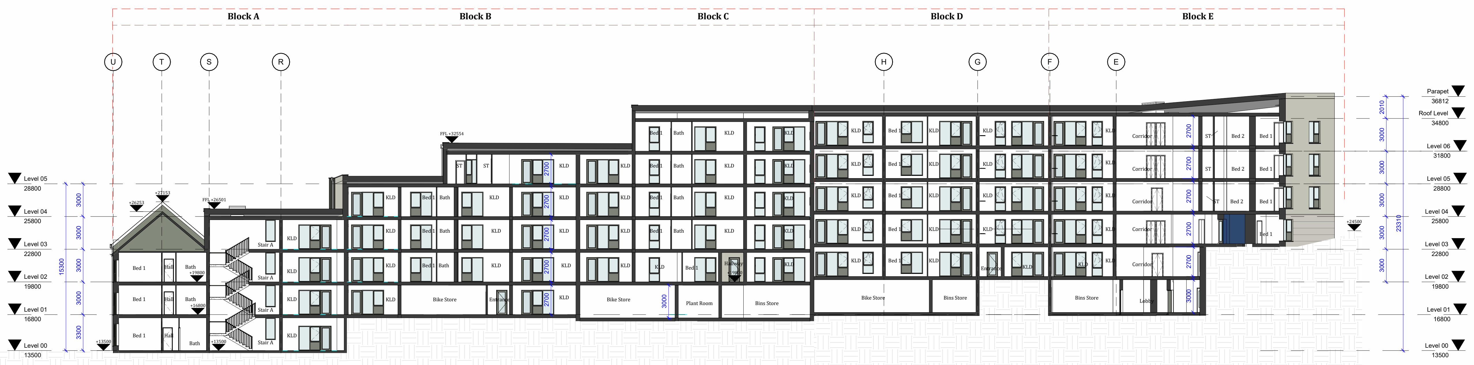
2 Overall Section B-B 1 : 200