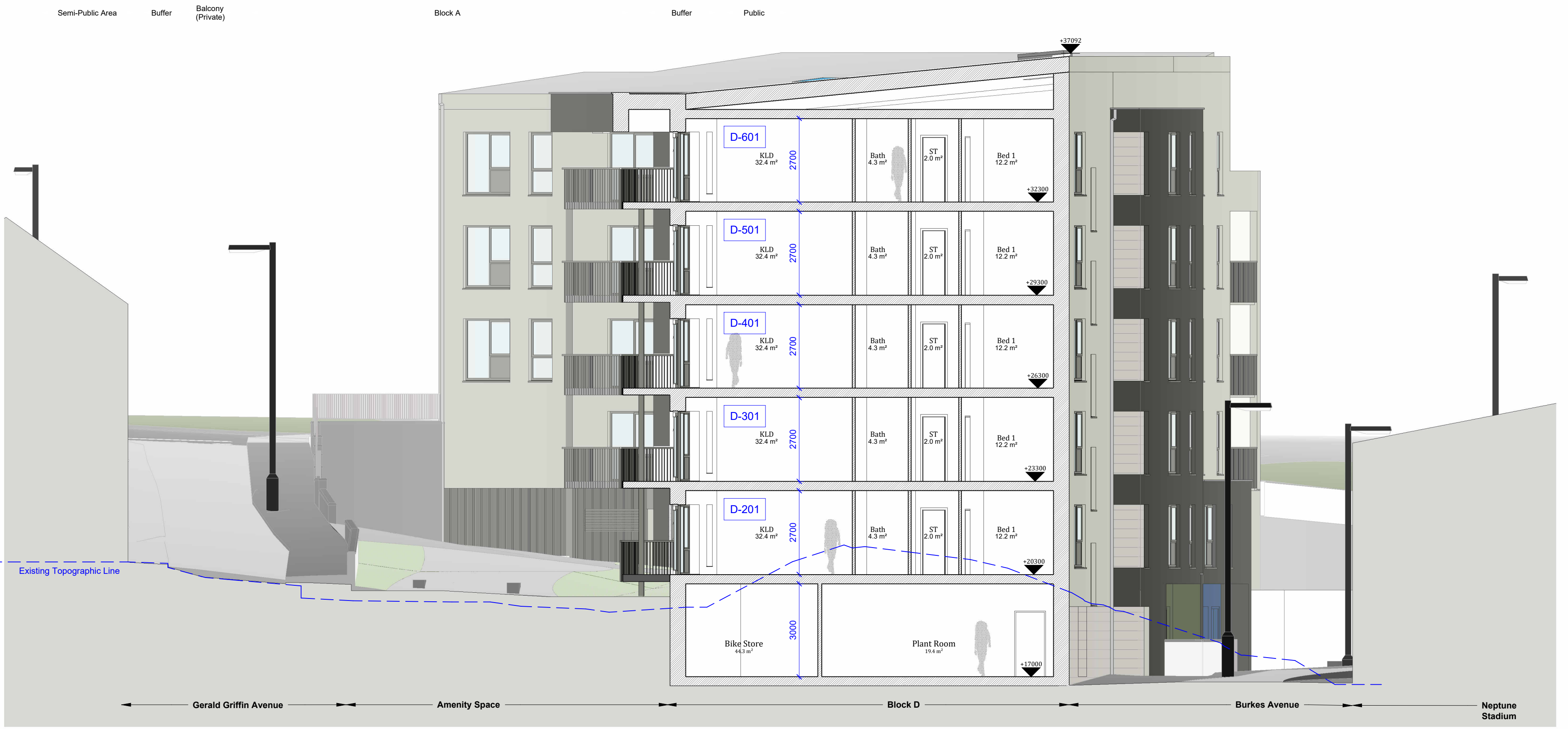
2 Overall GGS Section_Block D 1 : 100