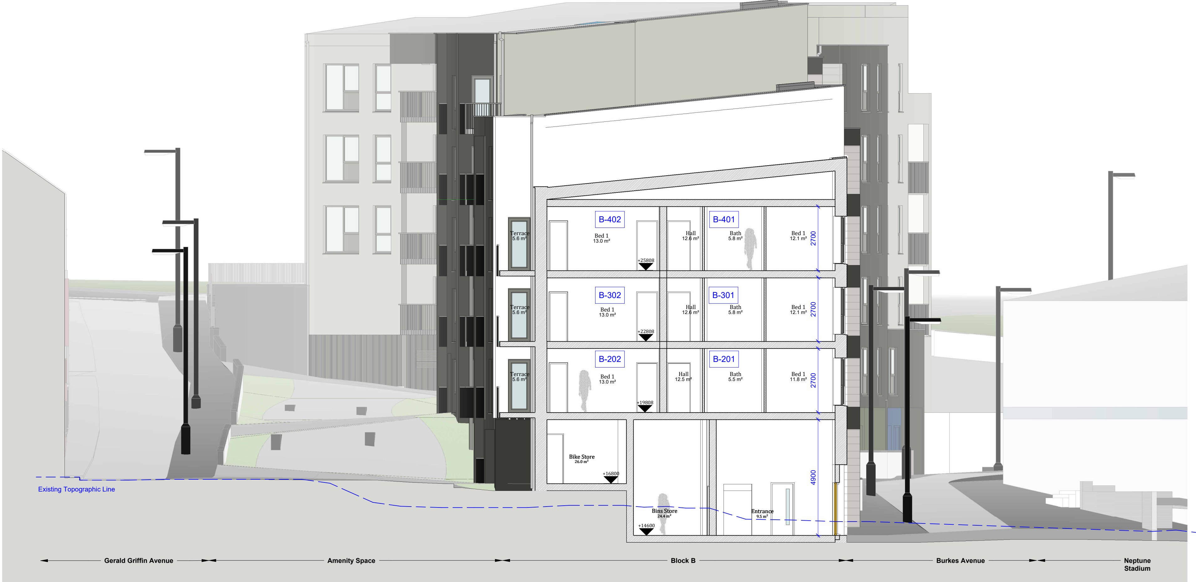
1 Overall GGS Section_Block B 1 : 100