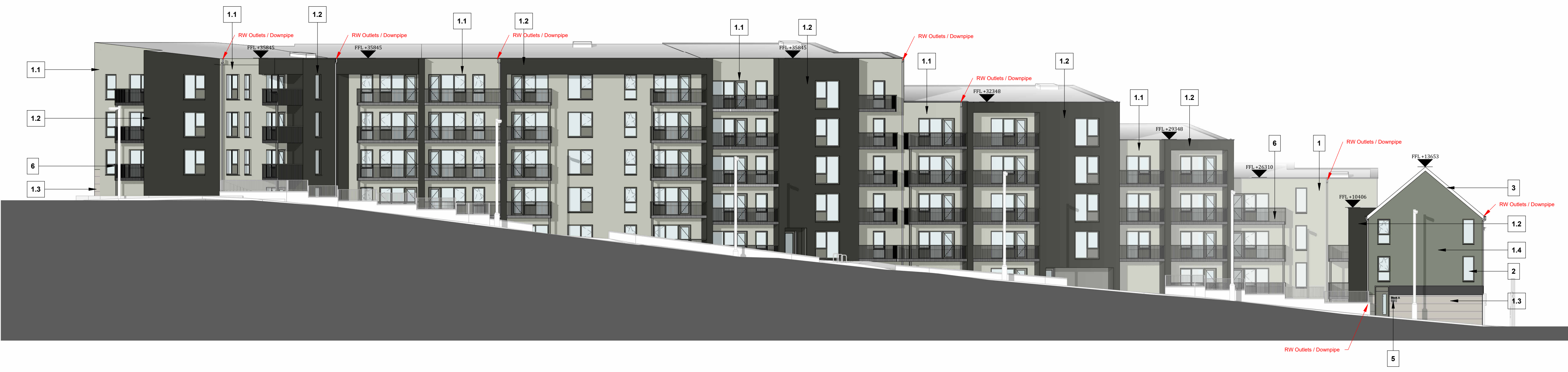
2 Gerald Griffin Avenue Elevation 1 : 200