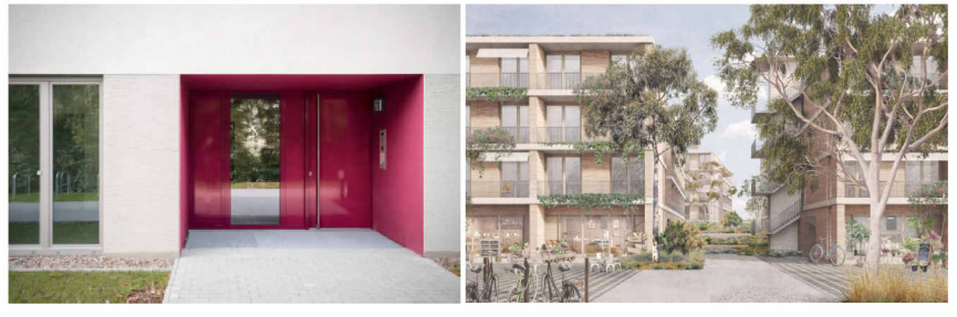
Reference project of Balcony structure and main entrances.