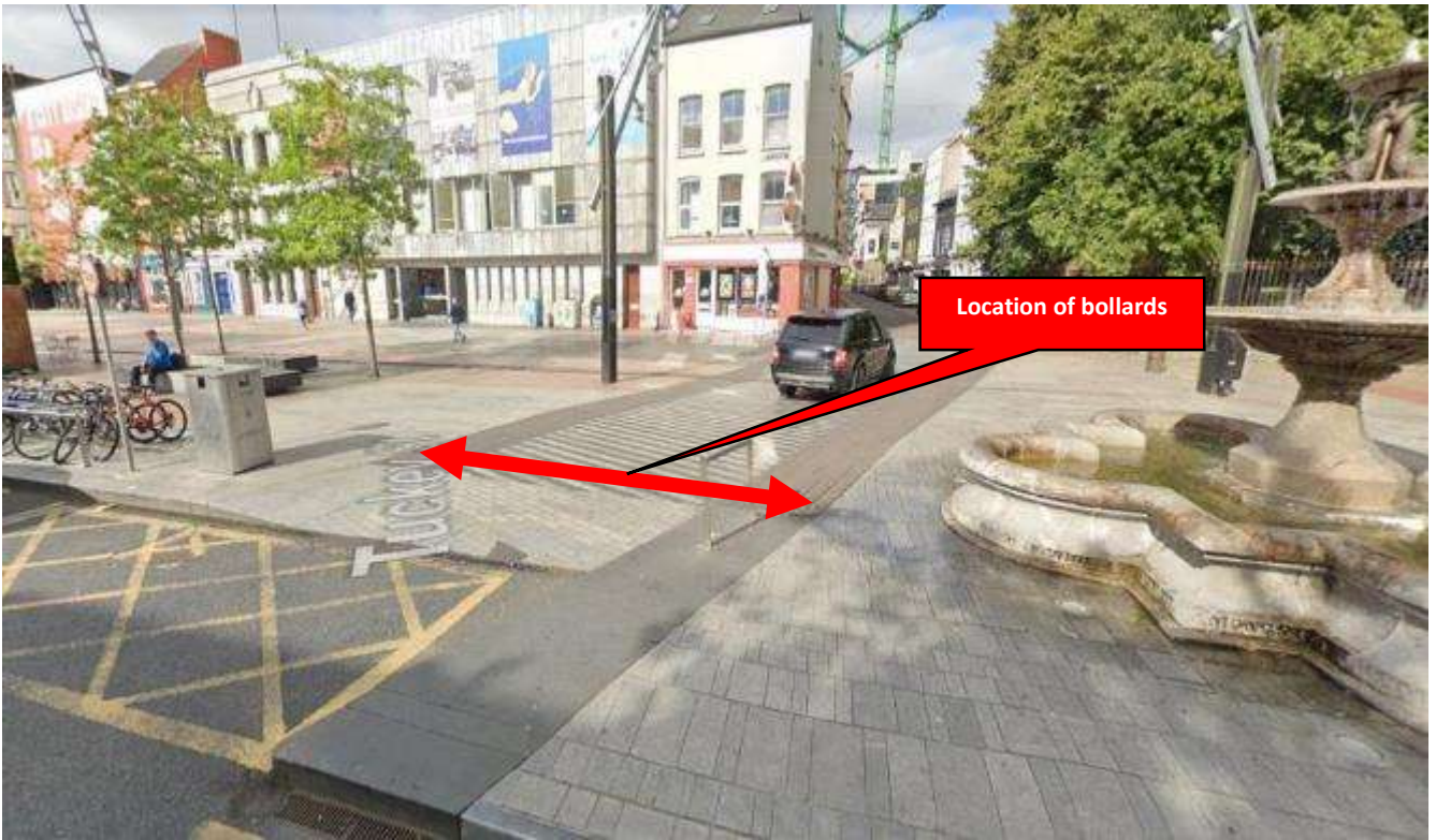
Figure 2: Road closure indicative location at junction with Grand Parade (source Google Maps)