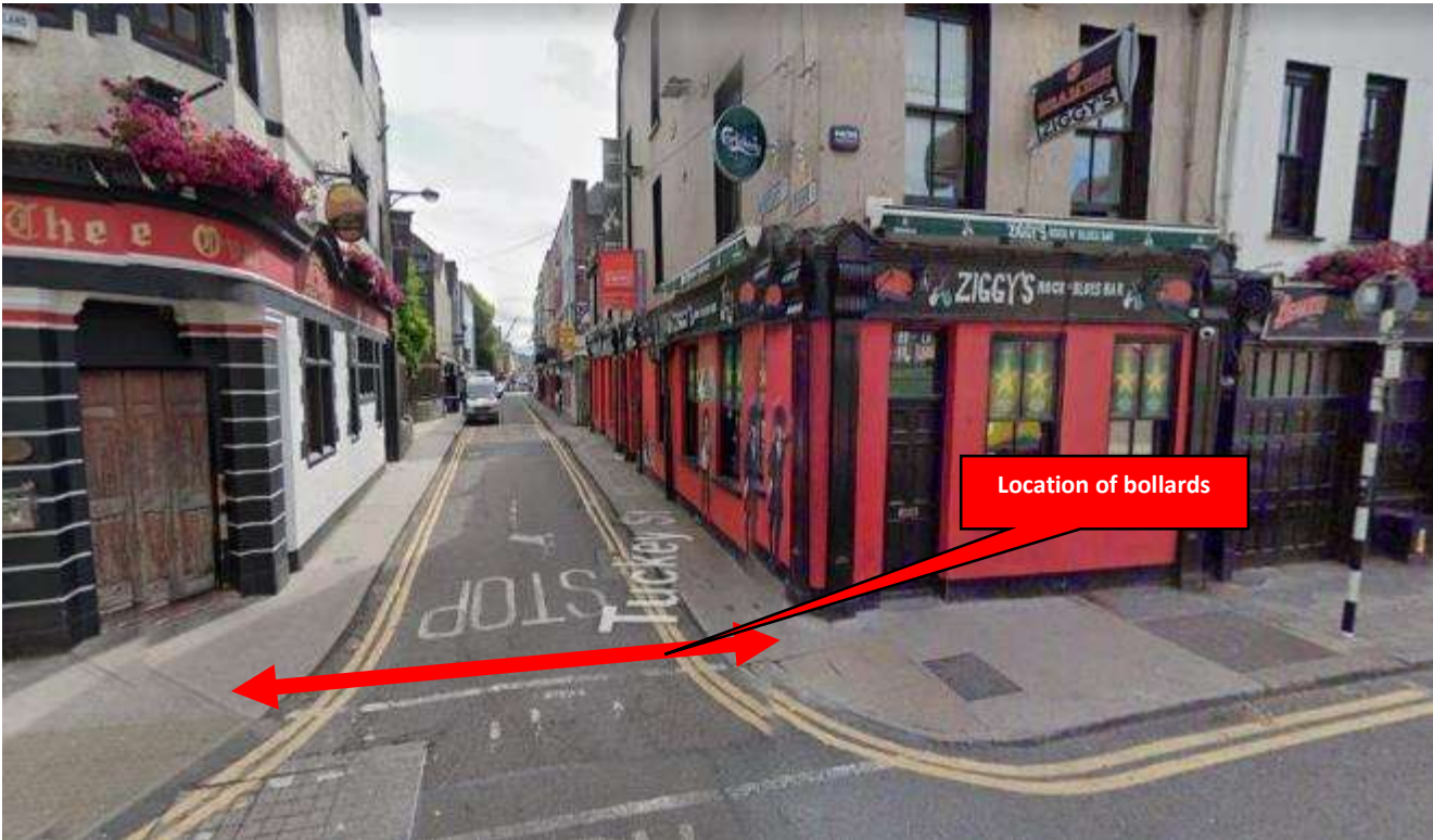
Figure 3: Road closure indicative location at junction of South Main Street