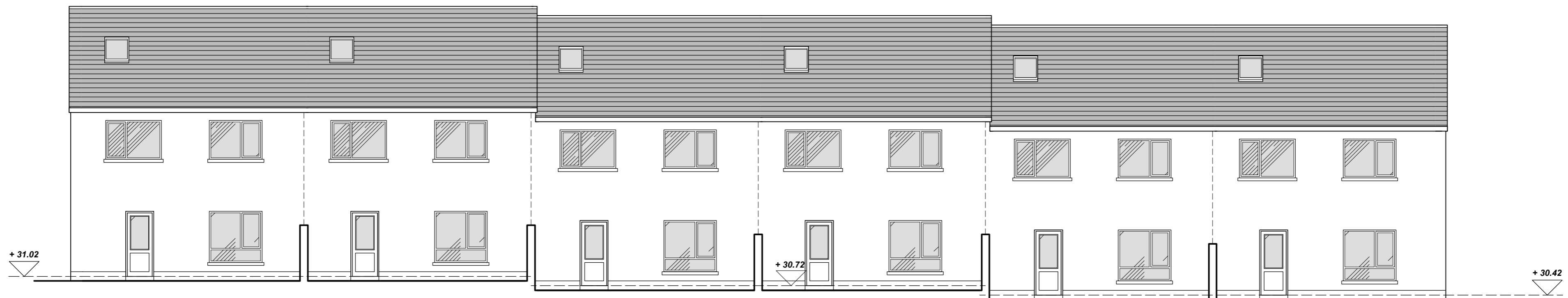
PROPOSED REAR (WEST) ELEVATION SCALE 1:100