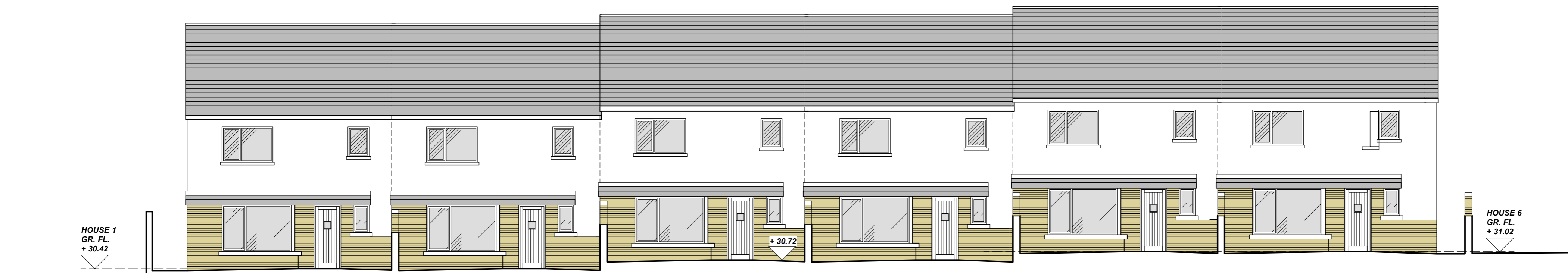
PROPOSED FRONT (EAST) ELEVATION SCALE 1:100

Note: Do not scale from drawings; use figured dimensions only This drawing to be read in conjunction with all relevant specifications and drawings All dimensions are in millimetres unless otherwise noted and are to be checked by Contractor on site Any discrepancies are to be notified to the Architect immediately