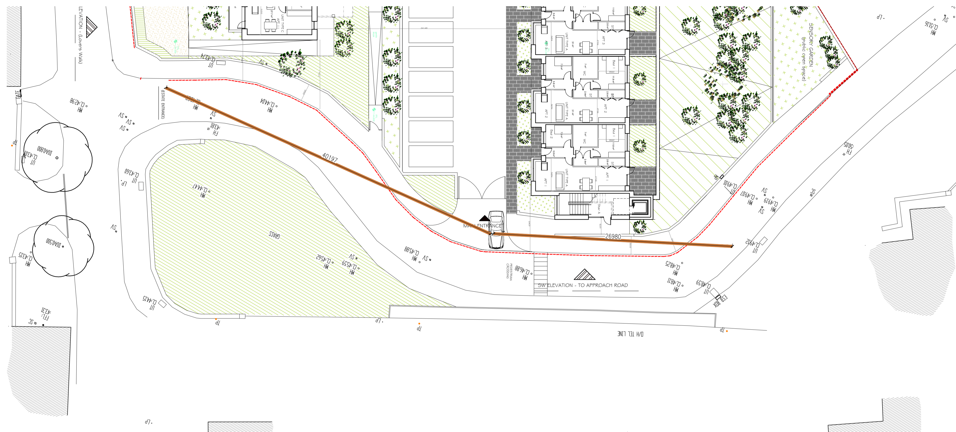
1 PLAN SHOWING SIGHTLINES SCALE 1:200