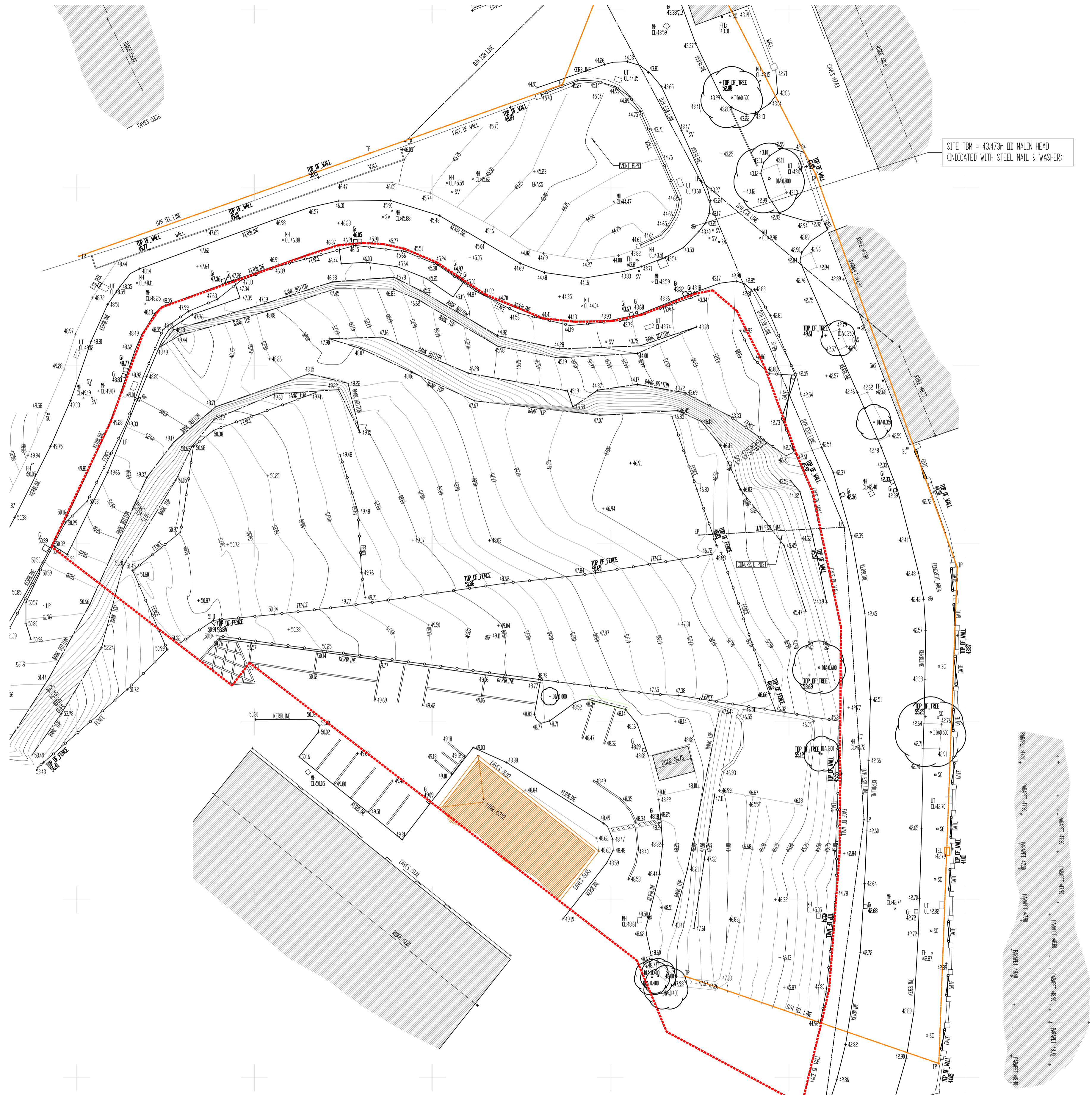
1 PROPOSED DEMOLITION PLAN 2 SCALE 1:250