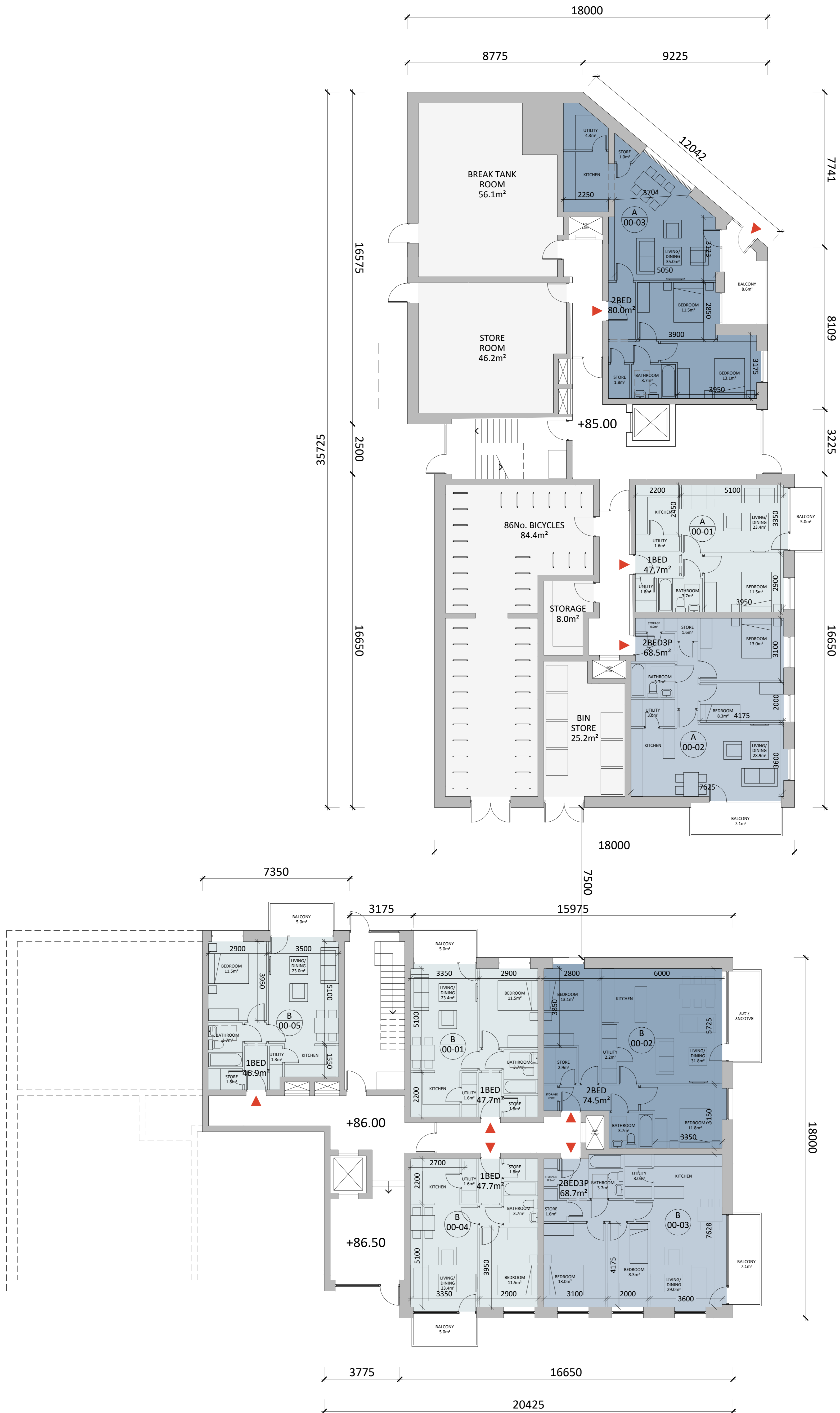
Level 00 Plan