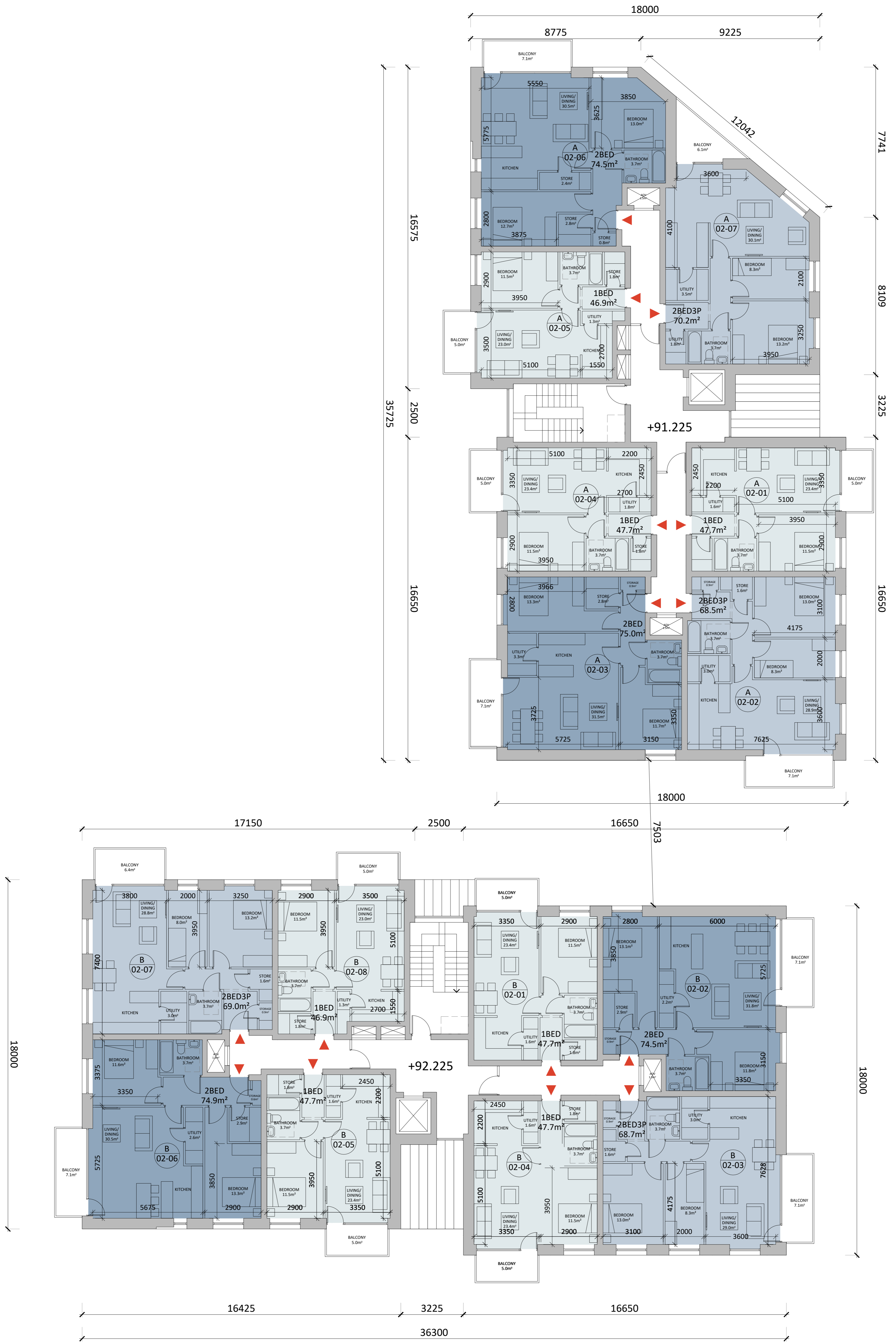
Level 02 Plan