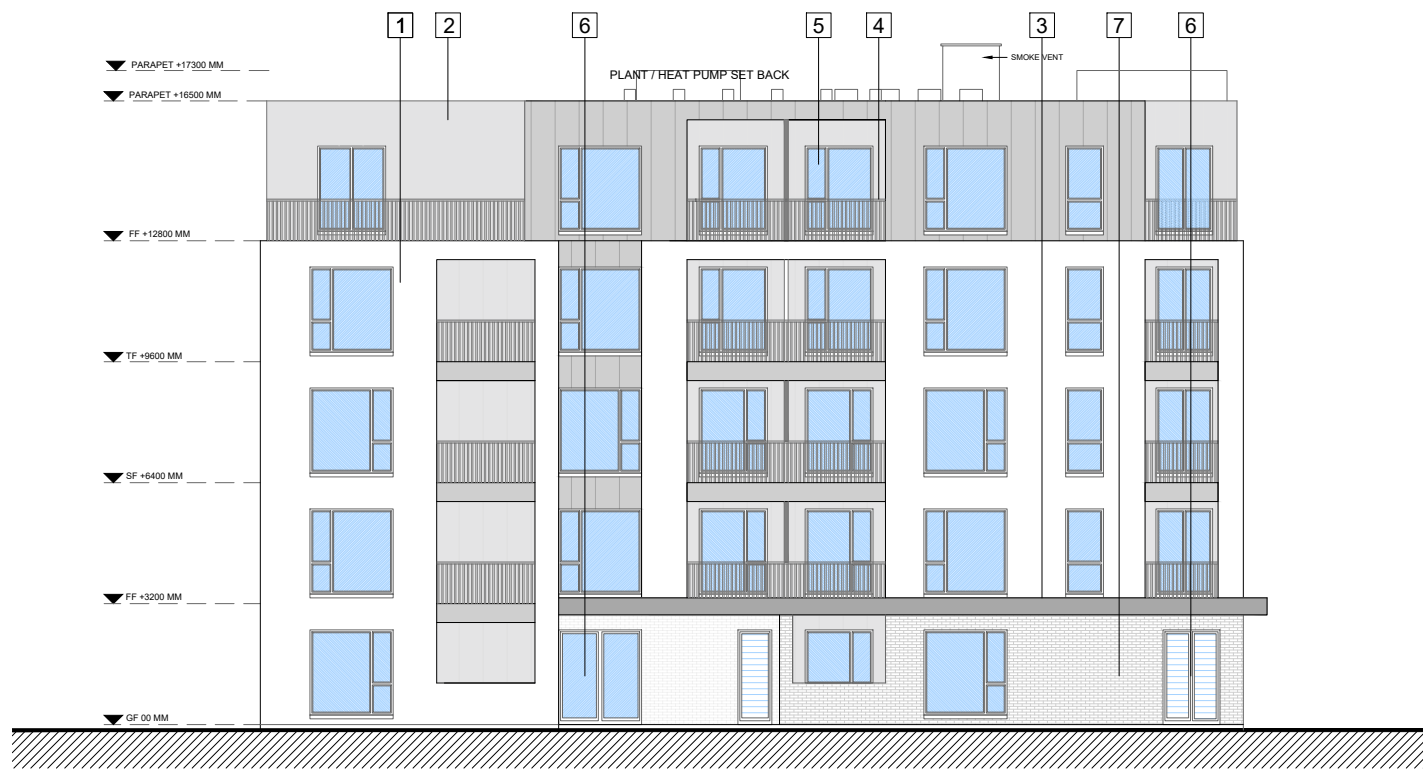
FRONT ELEVATION - EAST scale 1:200 @ A3

DO NOT SCALE. WORK TO FIGURED DIMENSIONS ONLY. ALL EXISTING DIMENSIONS TO BE CHECKED ON SITE. DRAWN ON AUTOCAD R2004 AT DEADY GAHAN ARCHITECTS LTD LAYERS ON THIS DRAWING COMPLY WITH BS 1192: PART 5