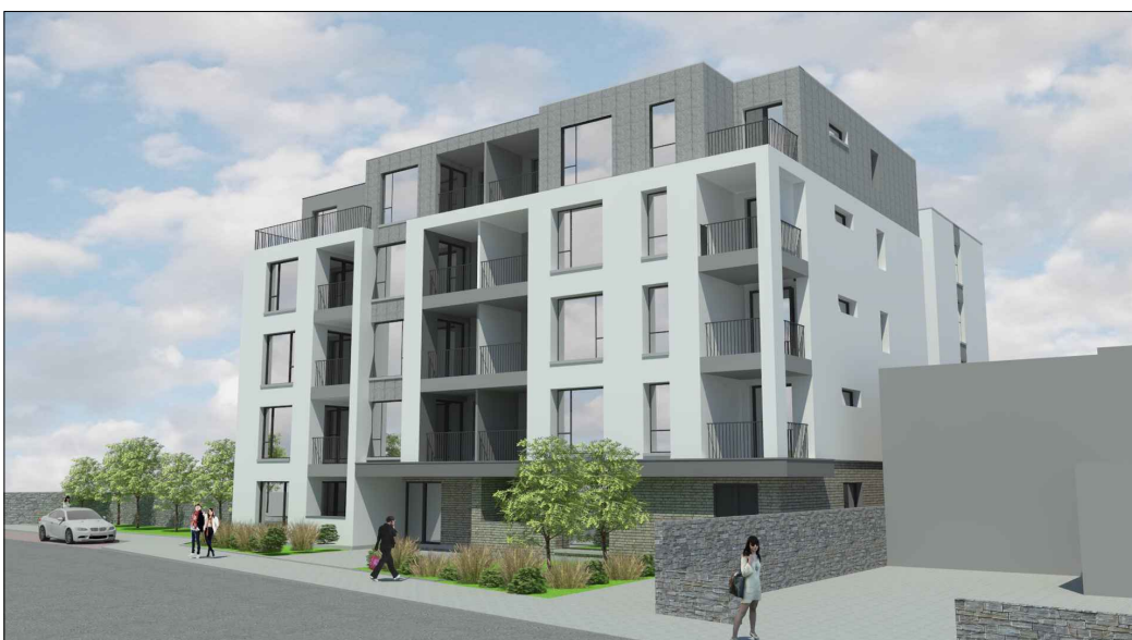
VIEW FROM EAST