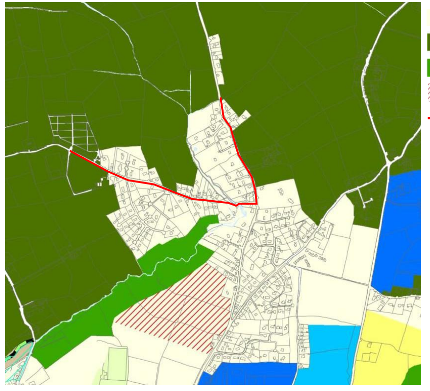
Figure 3.1: Land Use Zoning