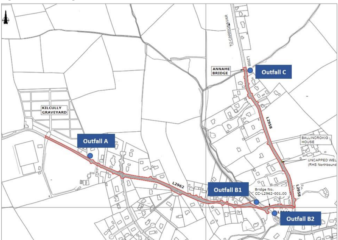
Figure 2.2: Discharge Points

B1 and B2, which drain to the River Glennamought respectively, will need alteration. Discharge point B1 does not have a formal outfall. As such, upgrades to this discharge point will require a precast headwall set back from the river channel with a natural stone channel with riparian planting. There is an existing outfall pipe downstream of Bridge CB-L2962-B-000, Discharge Point B2, which will likely require the installation of new pipes at this location.