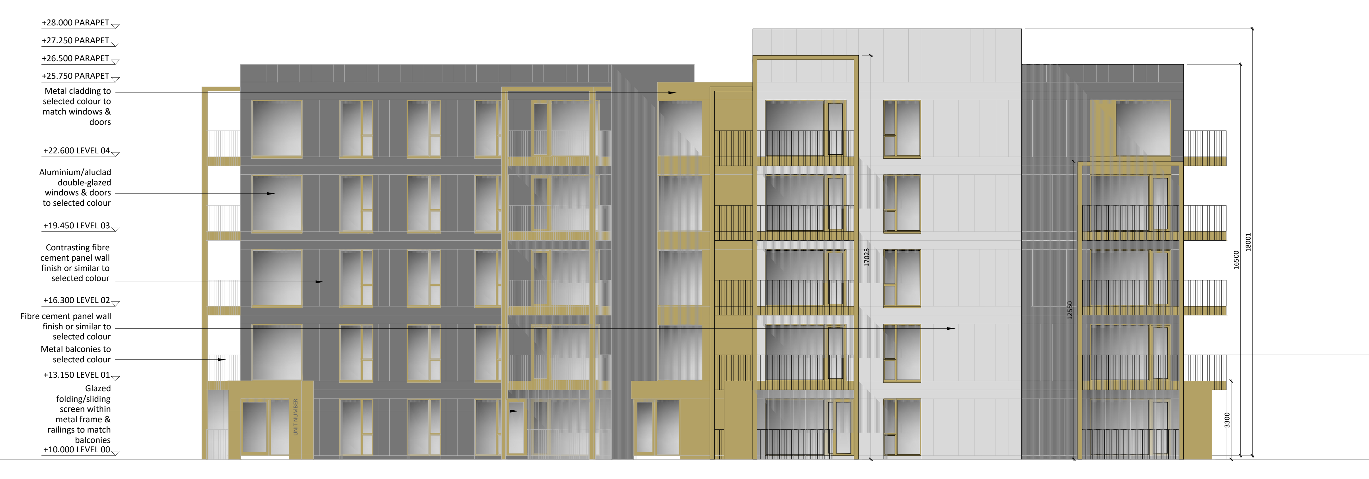
Block A - East Elevation to Bessboro Road