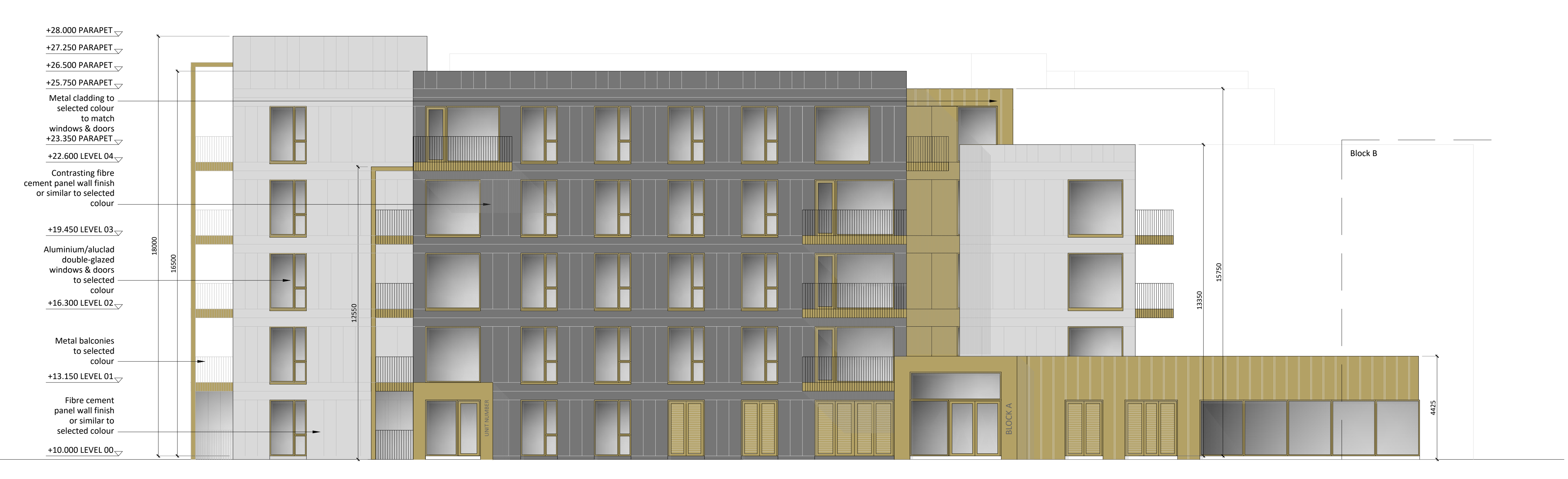
Block A - North Elevation