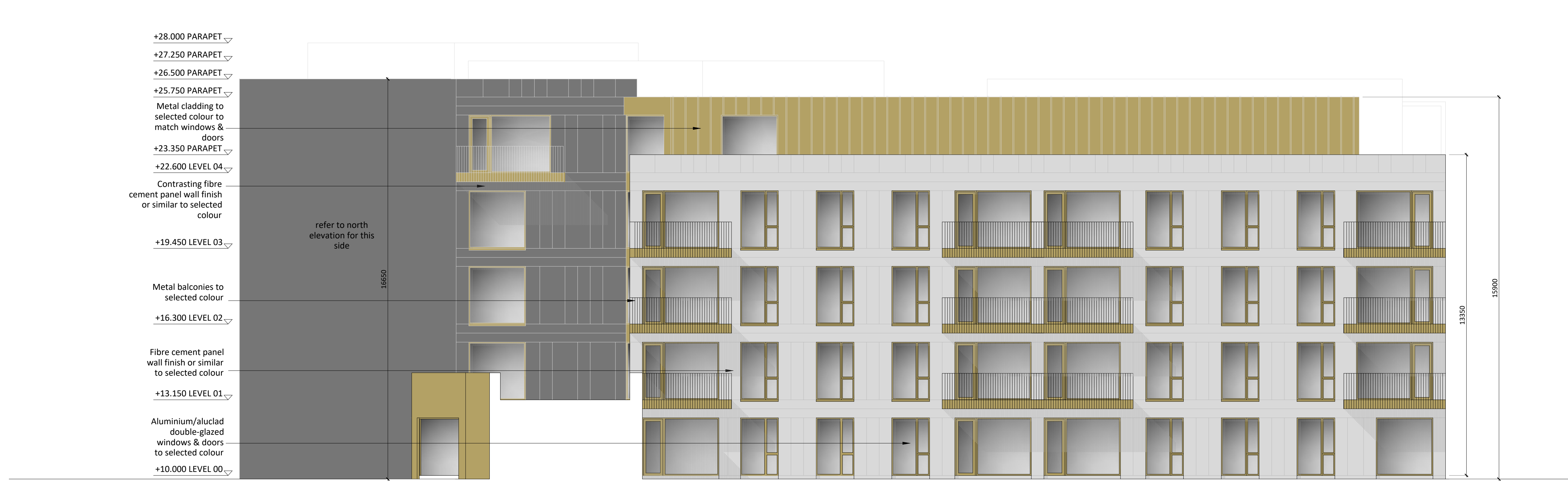
Block A - West Elevation