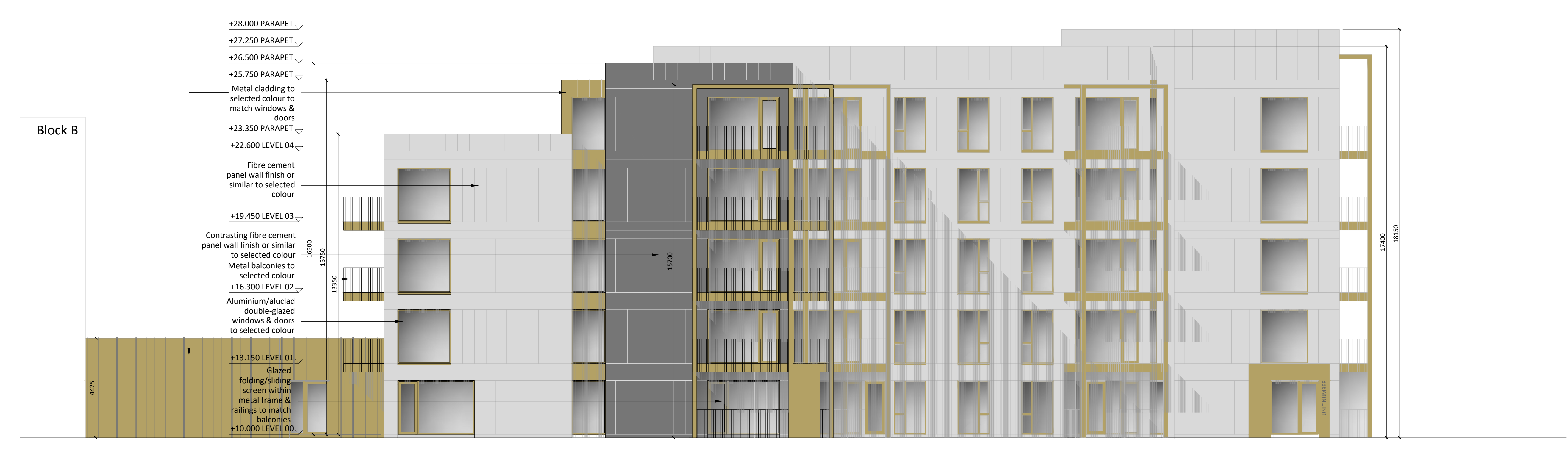
Block A - South Elevation