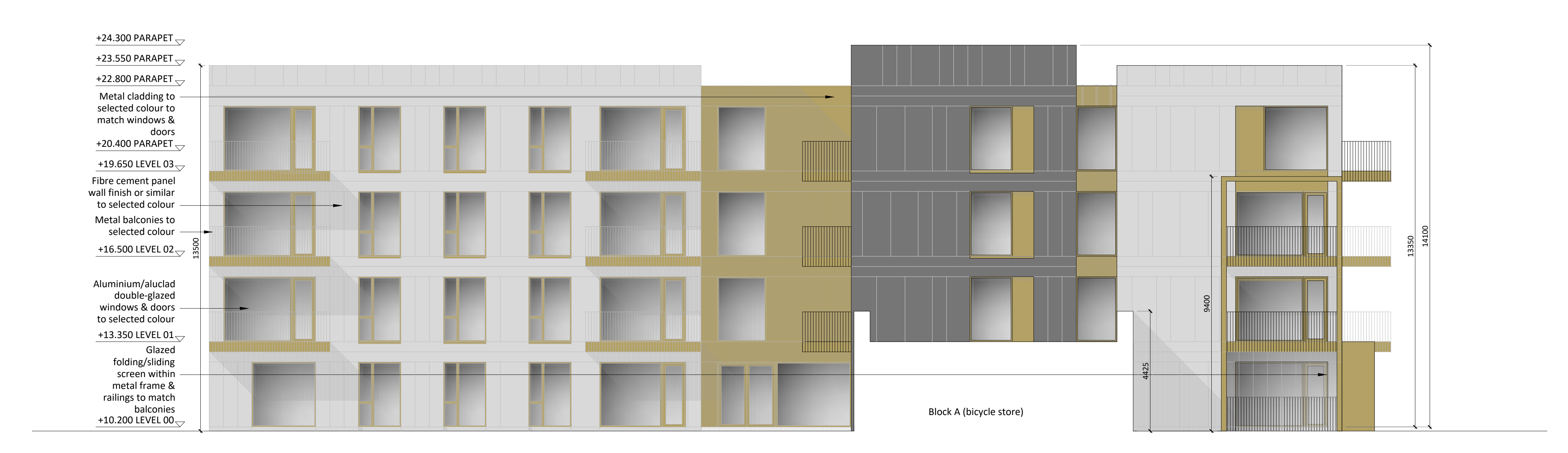
Block B - East Elevation