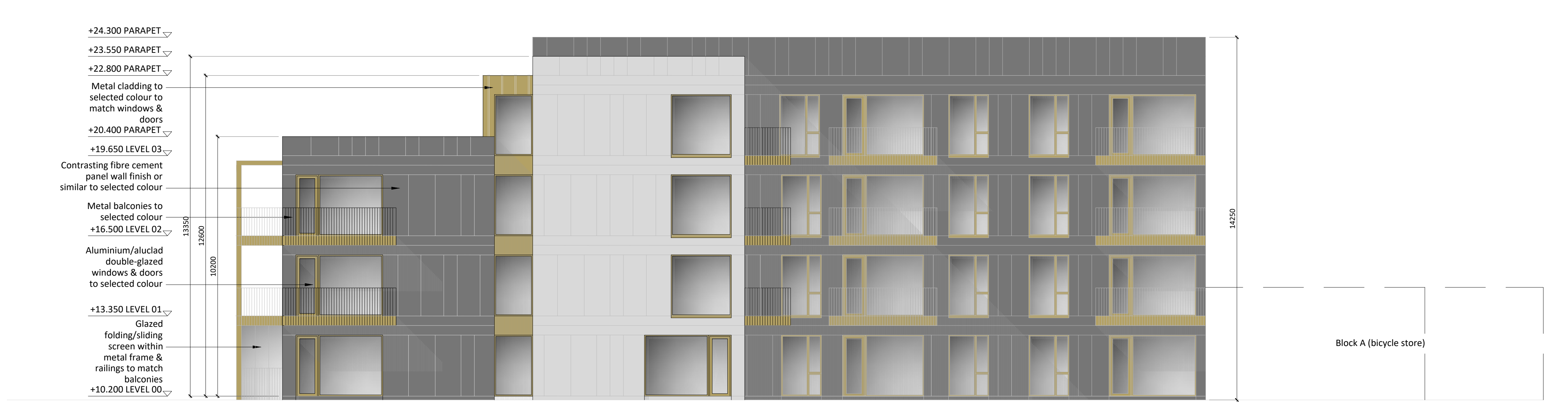
Block B - South Elevation