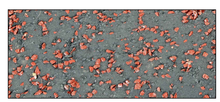
Blacktop finish with coloured chippings

NOTE: THIS DRAWING IS INTENDED FOR THE PURPOSE OF MAKING A PLANNING APPLICATION AND MAY NOT BE USED FOR ANY OTHER PURPOSE.