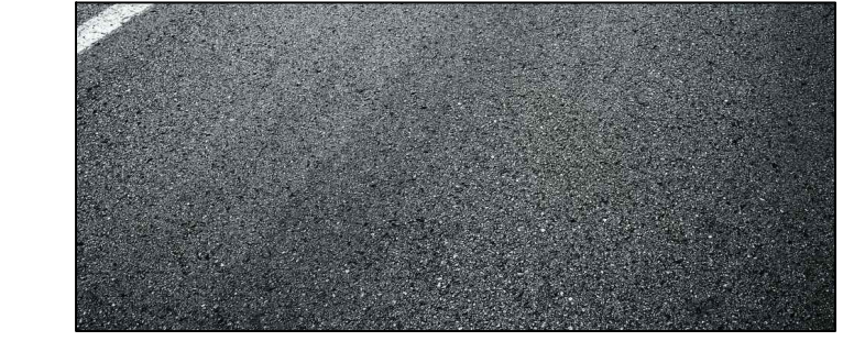
Tarmac surface finishe