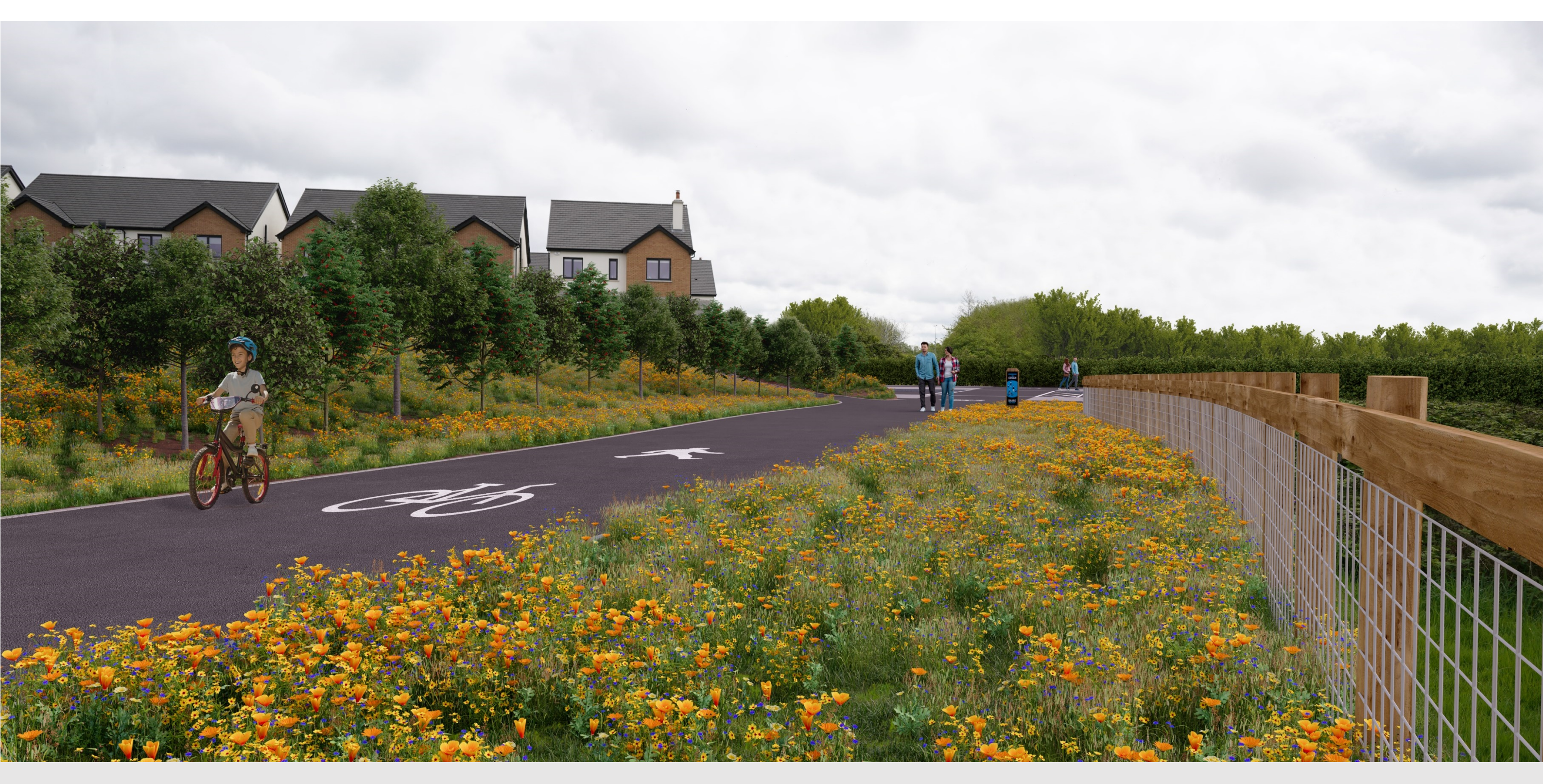
Verified View Photomontages for Proposed Phase 1 of the Maglin Greenway at Ballincollig, Cork