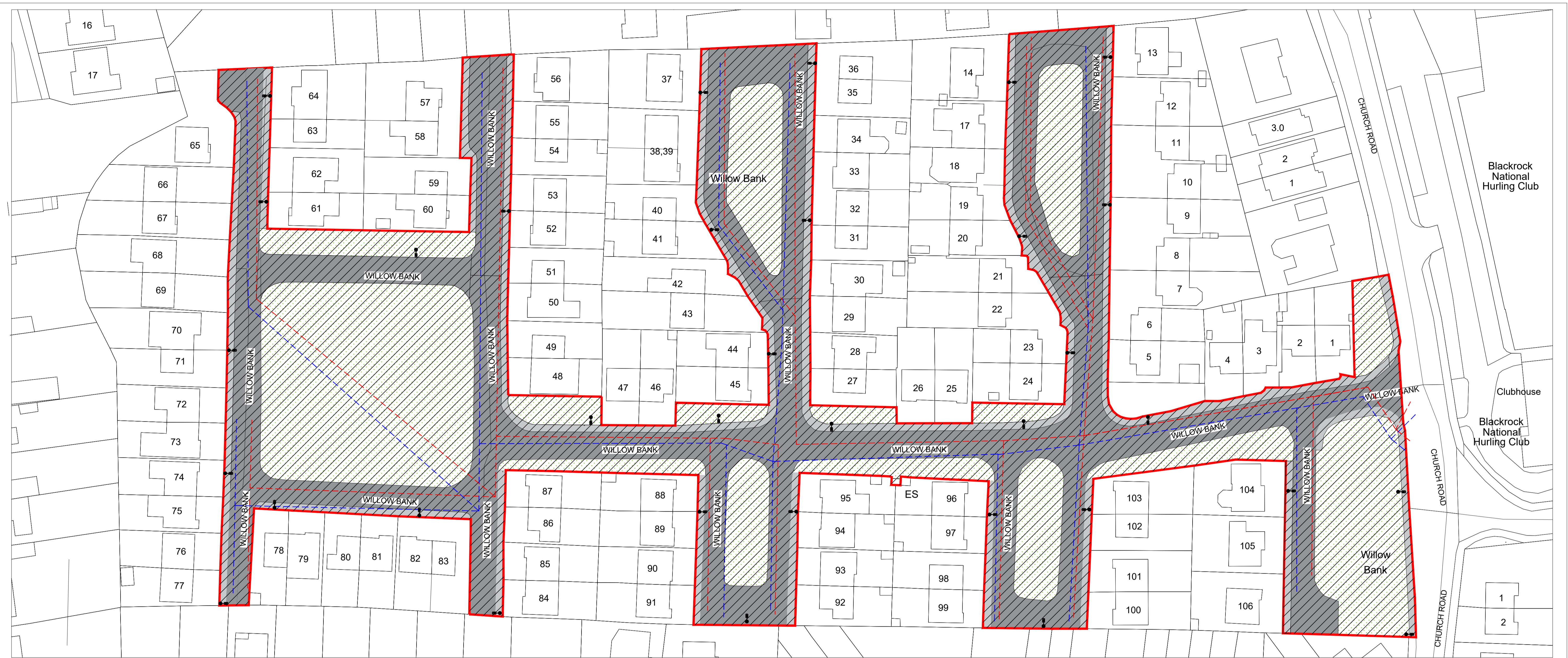
SITE LAYOUT PLAN 1:500