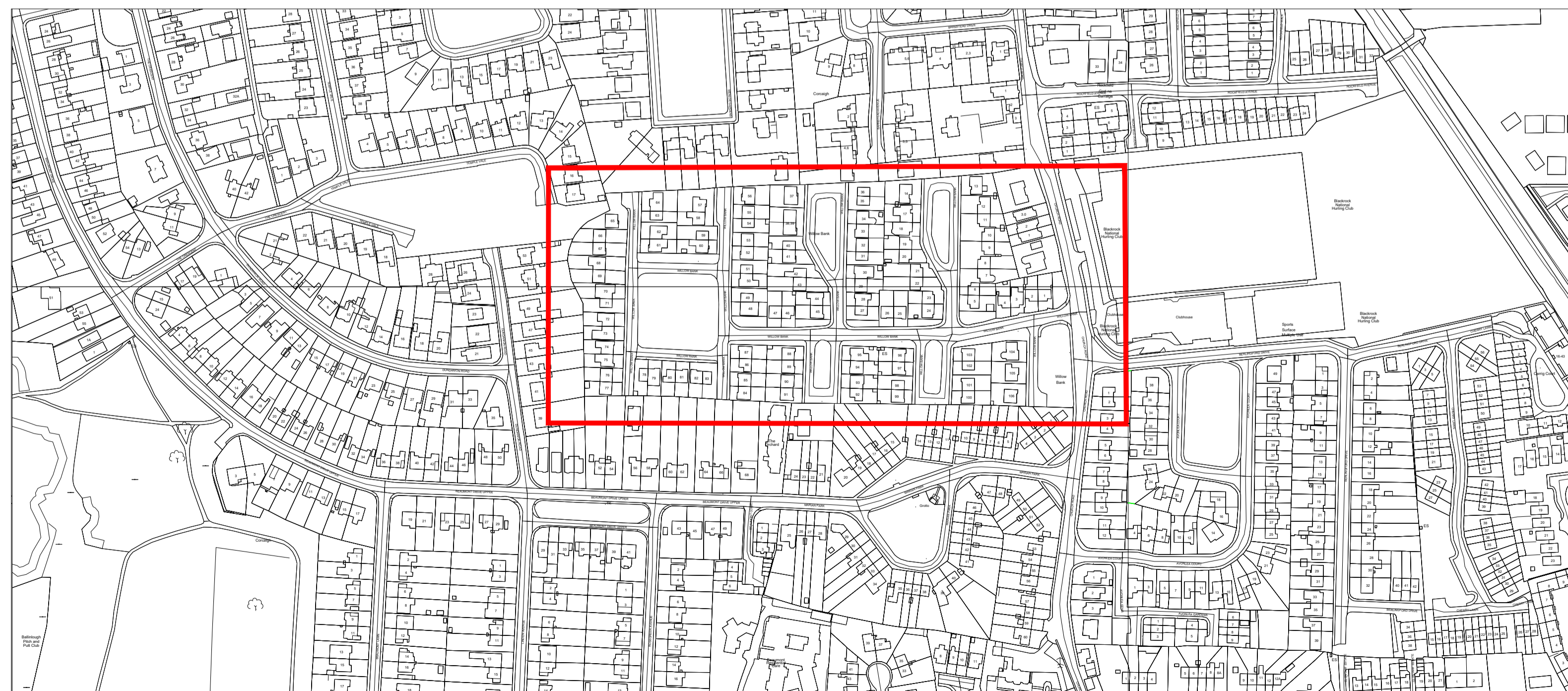
SITE LOCATION MAP 1:2500