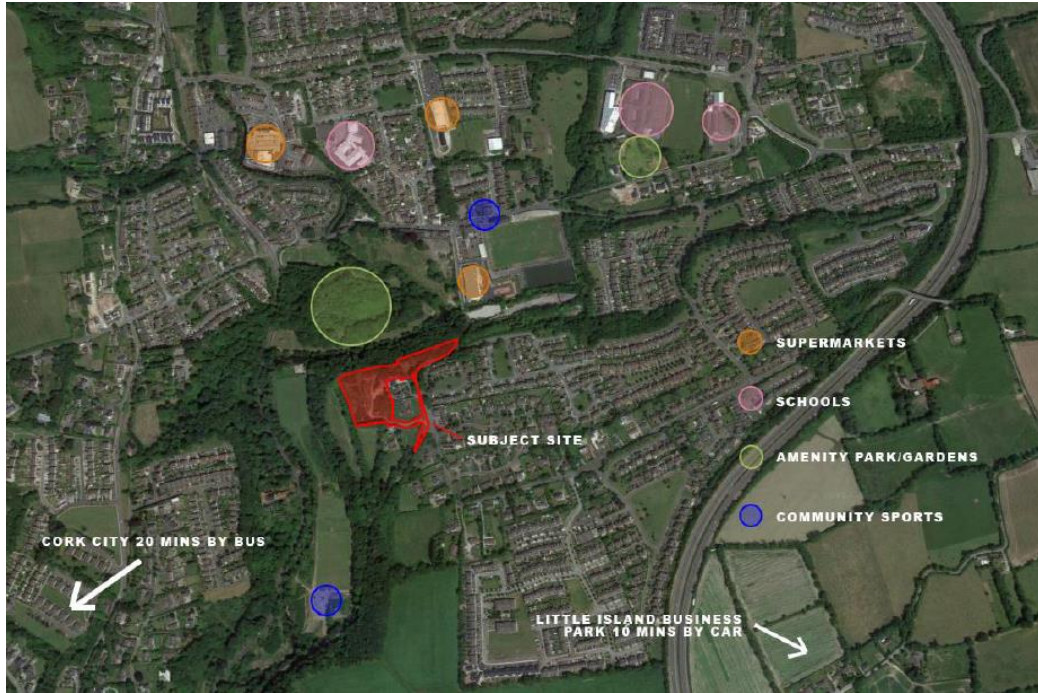
Figure 1 Location of site in context of Glanmire. Site outlined in red