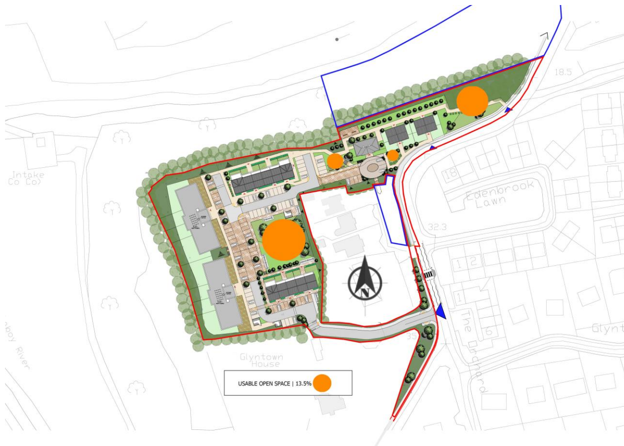
FIG.14: OPEN SPACE ACCESS PLAN

In addition to the private amenity areas, there is generous communal spaces within the development. These will contain hard and soft landscaped elements which will contribute to the quality of life for the residents. Units are designed to overlook these open spaces to provide passive surveillance throughout the development. The facing units of the scheme will create a strong edge within the scheme, overlooking the open space and amenity walk areas assisting with passive surveillance to the overall scheme.