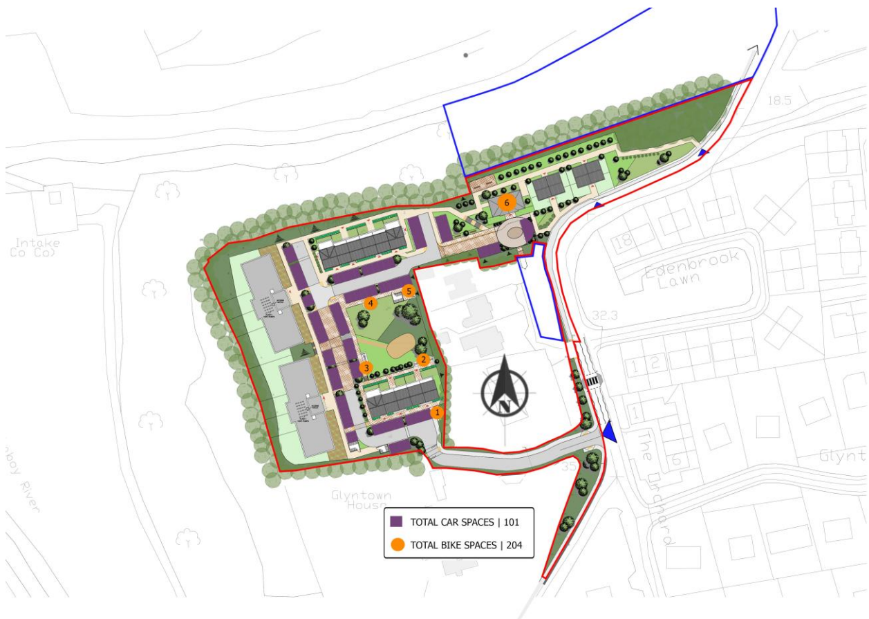
FIG.17: SITE PARKING STRATEGY

There is provision for a total of 101 parking spaces. This allows a provision for a total of 1.25 car parking spaces per unit provided for the dwellings within the development. Additionally, the location of the site promotes cycling, walking and the use of public transport. To facilitate this, generous pedestrian links and shared surfaces run through the scheme which also provides access to bike storage facilities for the provision of 204 bike spaces which exceeds the standards set out in the Design Standards for New Apartments document (2023).