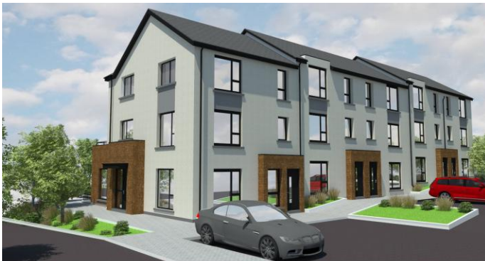
BLOCK 01 | FRONT ELEVATION

The proposed development has been designed to provide high quality residential units that will contribute positively to Glyntown and provide much needed housing to Metropolitan Cork. The proposed site layout focuses on the creation of distinctive open spaces with different material finishes that help generate a highly efficient scheme and assist our vision of place making.