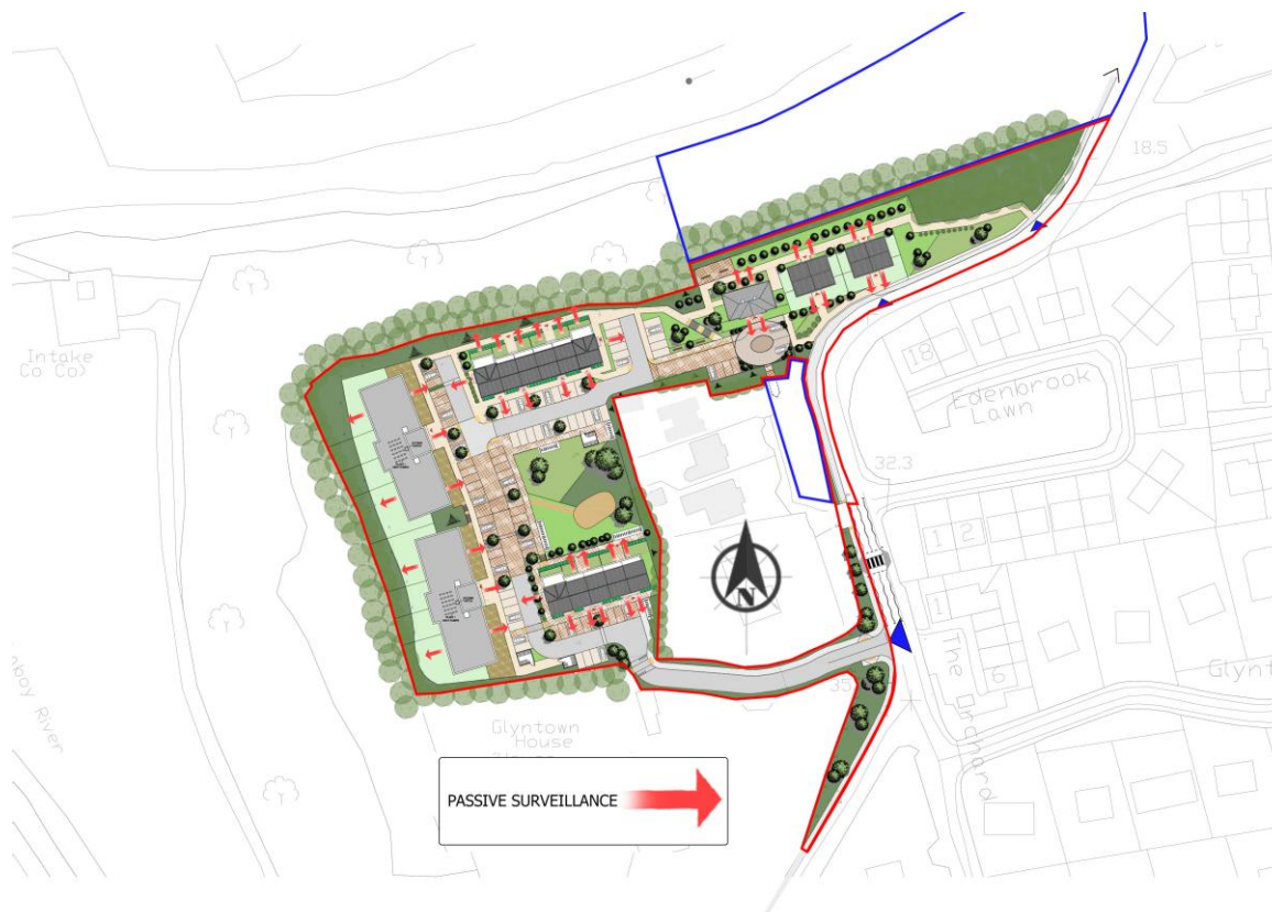
FIG.15: PASSIVE SURVIELANCE OVER OPEN SPACES & STREETScape

The proposed layout has been arranged to maximise the sites development potential. Dwellings within the scheme are arranged to overlook the communal open spaces and amenity walkways while the overall layout has been organised to prevent overlooking of adjoining properties. Two feature corner buildings along the central road of the scheme have been used to create a triple fronted unit that addresses the internal street as well as the open space. The site also contains a generous pedestrian links and shared surfaces that runs along the open space with access to bike storage. This will ensure that an inclusive development is formed whereby all residents have access to the on-site amenities.