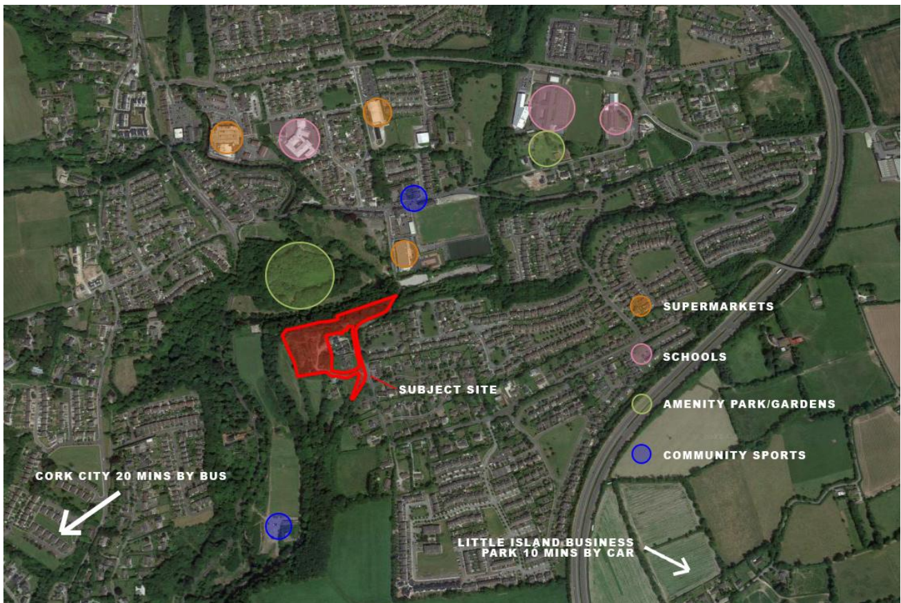
FIG.01: SITE LOCATION

The development site is located at Glyntown, on the outskirts of Cork City. The site is in close proximity to the town of Glanmire, with a number of schools, supermarkets and community amenities nearby. Cork City centre is 20 minutes by public transport from the site location.