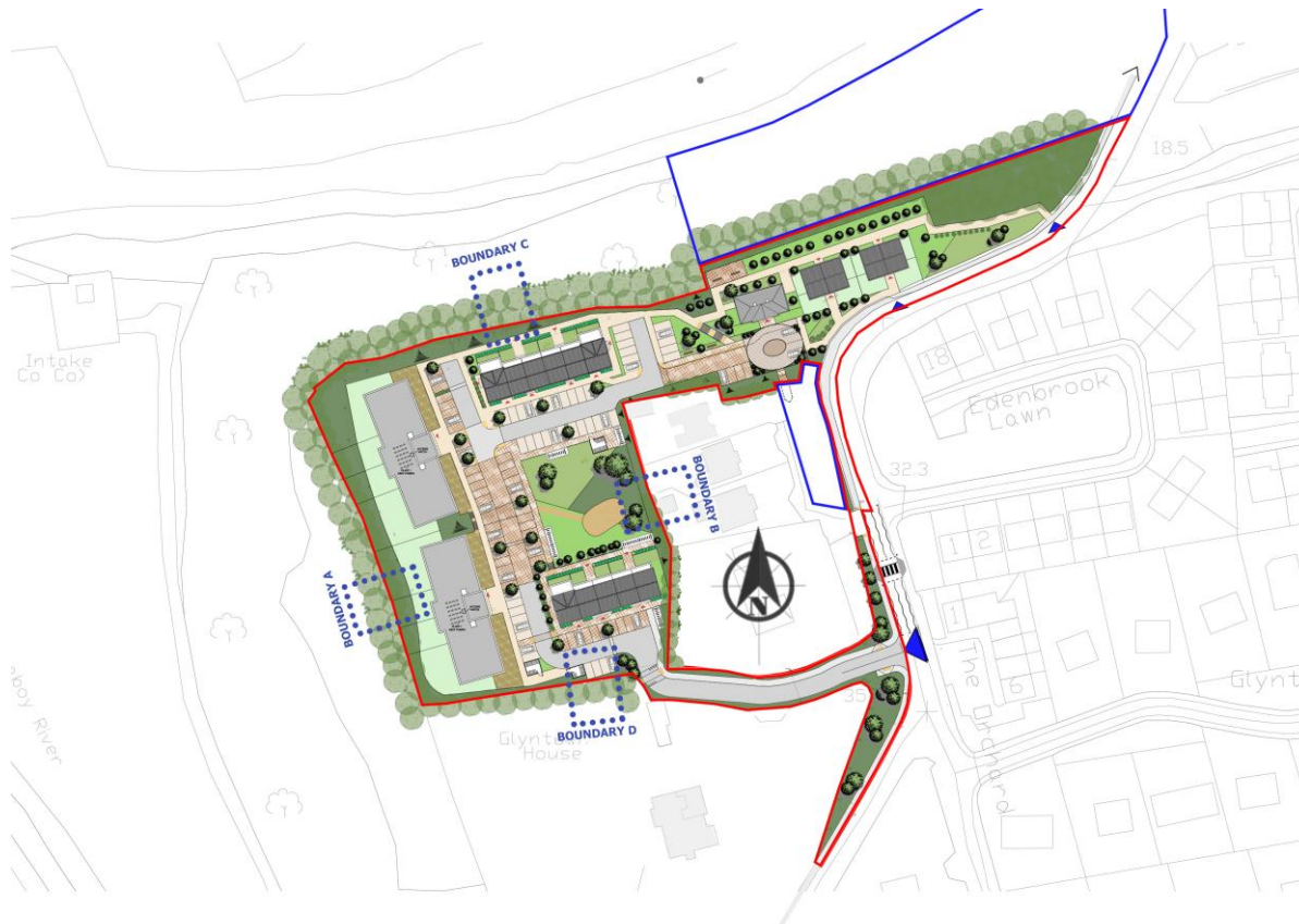
FIG.08: SITE BOUNDARY CONDITIONS

The site will be accessed from an entrance to the east of the site which is located along East Cliff Road. This entrance will be supplemented with pedestrian footpaths and crossings for the safety of the residents. The entrance will also be supplemented with additional planting to act as a buffer to the adjoining dwellings. The existing vegetation (trees/hedgerow) are to be maintained and supplemented with a 2.0m high weld mesh to the west of the site (Boundary A). To the east (Boundary B), a 2.0m high blockwork wall is proposed that will be rendered and capped to the public face with additional planting to provide a boundary to the adjacent dwellings. To the north (Boundary C), the existing dense forestry will be maintained and supplemented with a 2.0m high weld mesh fence. Additionally, to the south, a 2.0m high weld mesh fence will be provided and the existing vegetation maintained.