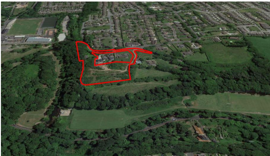
FIG.06: ARIAL VIEW FROM THE WEST