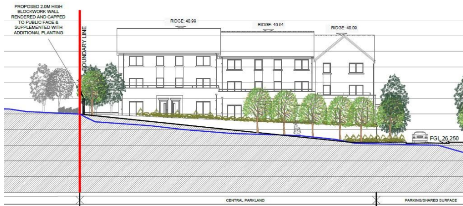
FIG.10: SITE BOUNDARY CONDITION B

A 2.0m high blockwork wall, rendered and capped to the public face is proposed along the eastern boundary of the site. This is done to provide a distinct boundary between the proposed open space and the adjacent dwellings to the east. Additionally, this blockwork wall will be supplemented with additional planted where necessary.