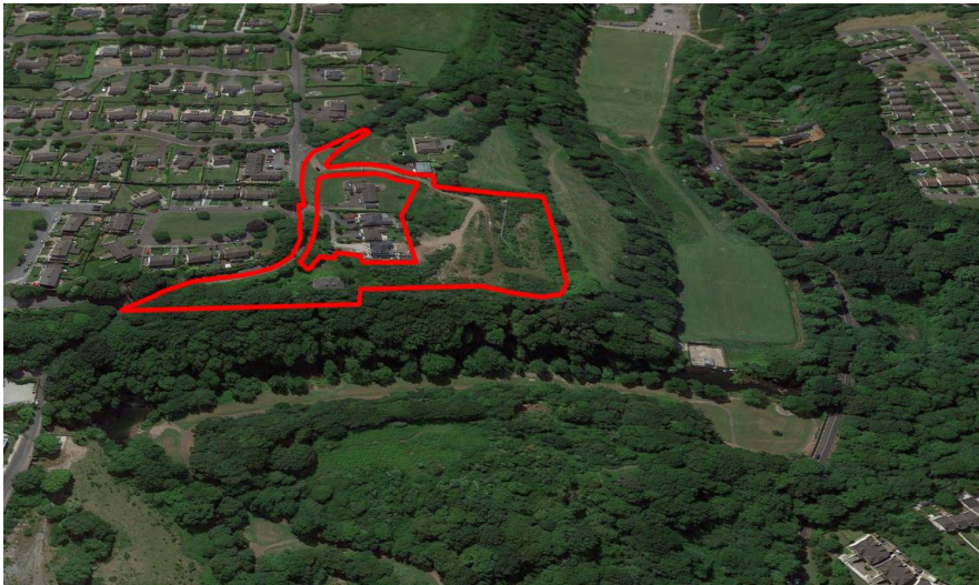
FIG.03: ARIAL VIEW FROM THE NORTH