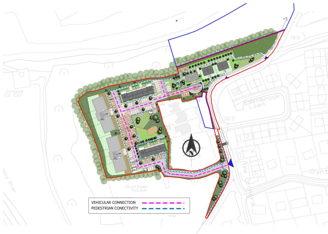
FIG.13: SITE ACCESS & CONNECTIONS PLAN

The proposed development has been designed in accordance with DMURS in order to create a development with an urban feel whilst also creating a safe environment for all road users. The scheme is based within the townlands of Glyntown, Glanmire making it easily accessible for residents via public transport. Cork city centre is within 20 minutes of the site by public transport and 30 by bicycle. There are bus stops within a 2 minute walk of the site which provides excellent transport links.