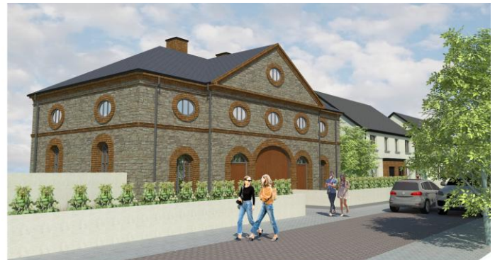
BLOCK 03: COACH HOUSE | FRONT ELEVATION