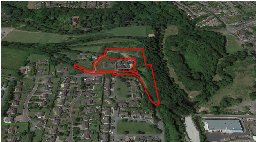
FIG.05: ARIAL VIEW FROM THE EAST