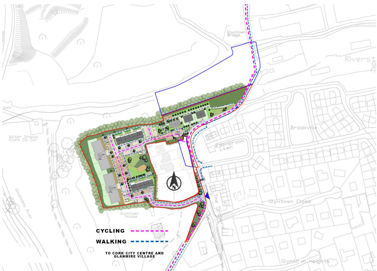
FIG.02: SITE SUITABILITY

The site is situated in Glyntown close to Glanmire. The location of the site promotes cycling, walking and the use of public transport; encouraging future residents towards sustainable modes of transport as an alternative to car use. The site is approximately a 20 minutes journey by public transport from Cork City Centre. The scheme location lends itself to residential development with an existing residential scheme to the East and community retail and leisure facilities nearby. The nearest supermarket is just 3 minutes' walk away while two other supermarkets as well as other retail amenities are 10 minutes' walk. John O' Callaghan Community Park is just a 10 minute walk away. The topographical nature of the site lends itself to development with the layout complementing neighbouring schemes.