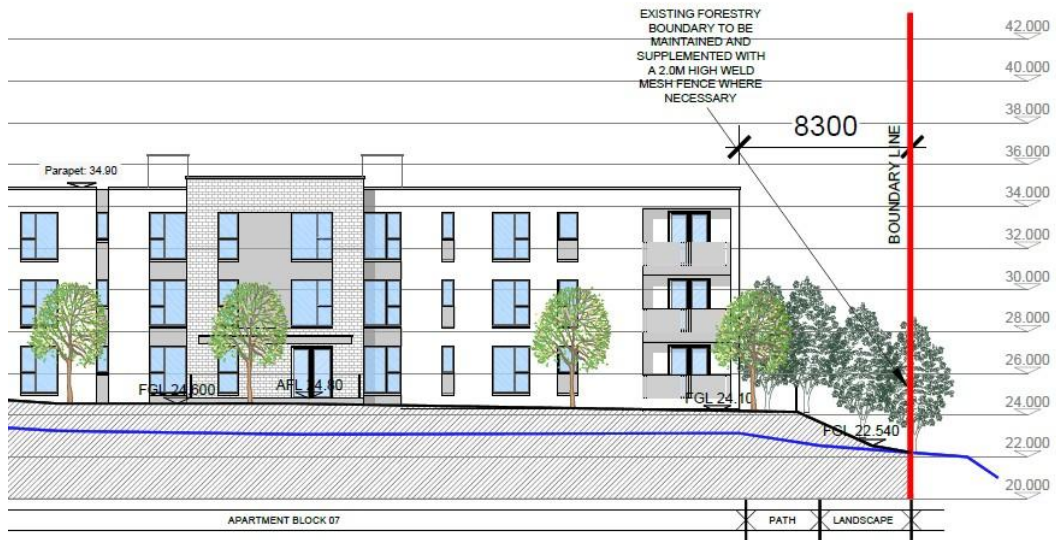
FIG.11: SITE BOUNDARY CONDITION C

It is proposed to maintain the existing forestry boundary and supplement it with a 2.0m high weld mesh fence where necessary. Maintaining this boundary will be a positive visual amenity for the proposed amenity walk along this boundary.