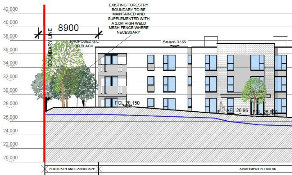
FIG.12: SITE BOUNDARY CONDITION D

It is proposed to maintain the existing vegetation (trees/hedgerow) boundary and supplement it with a 2.0m high weld mesh fence where necessary.