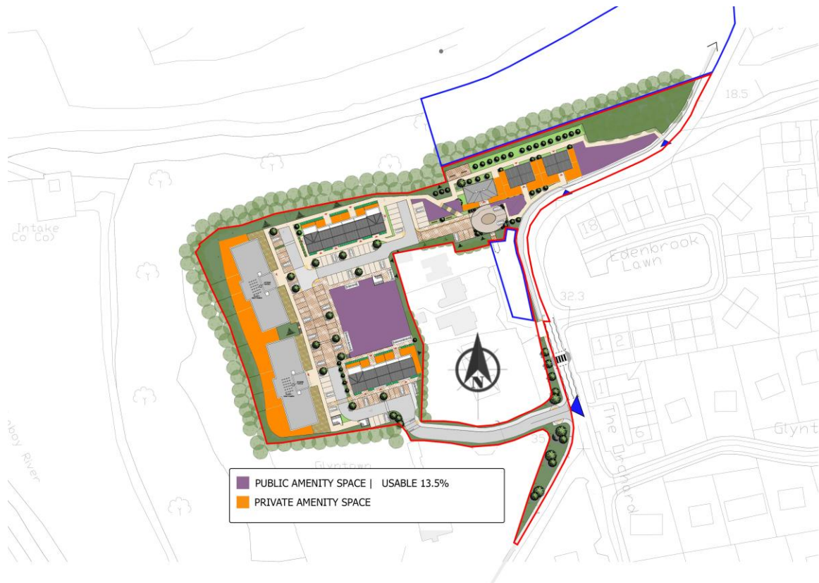
FIG.16: PUBLIC & PRIVATE AMENITY SPACES

Each home has access to a generous private amenity space and a large central green open space with a neighbourhood playground.