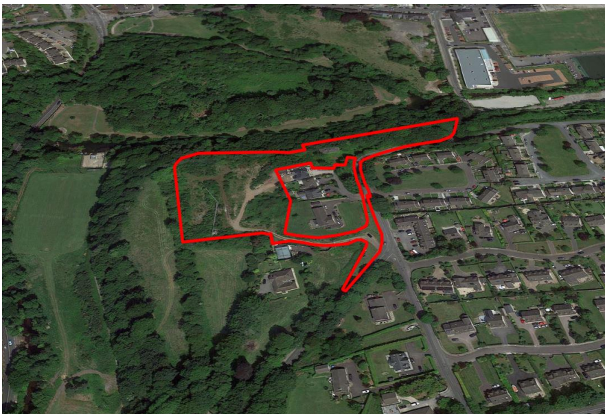
FIG.04: ARIAL VIEW FROM THE SOUTH