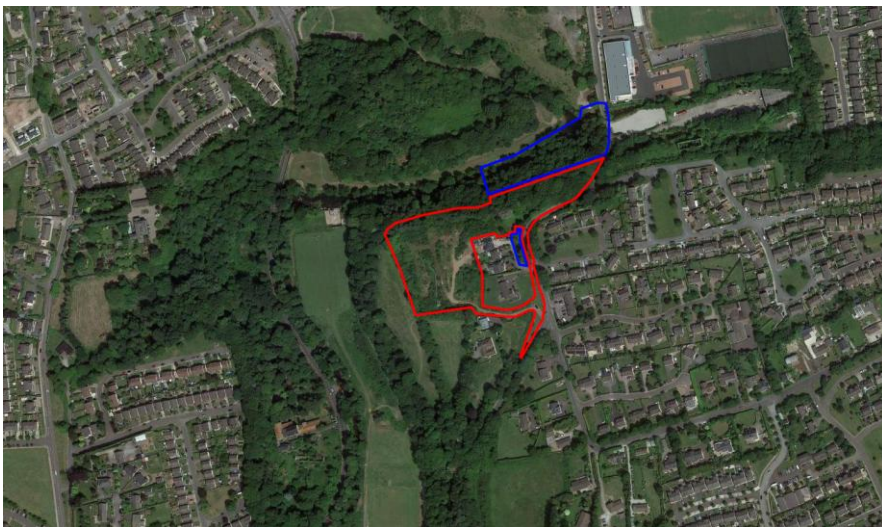
FIG.07: ARIAL VIEW FROM DIRECTLY ABOVE WITH BLUE LINE BOUNDARY