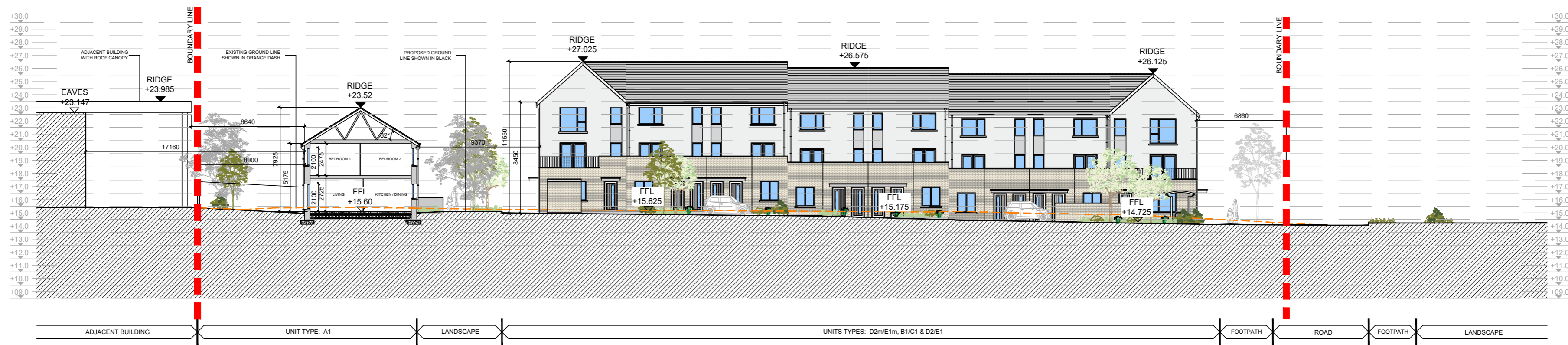
PROPOSED SITE SECTION C-C SCALE 1:250@A2

DO NOT SCALE. WORK TO FIGURED DIMENSIONS ONLY. ALL EXISTING DIMENSIONS TO BE CHECKED ON SITE. DRAWN ON AUTOCAD R2004 AT DEADY GAHAN ARCHITECTS LTD LAYERS ON THIS DRAWING COMPLY WITH BS 1192: PART 5