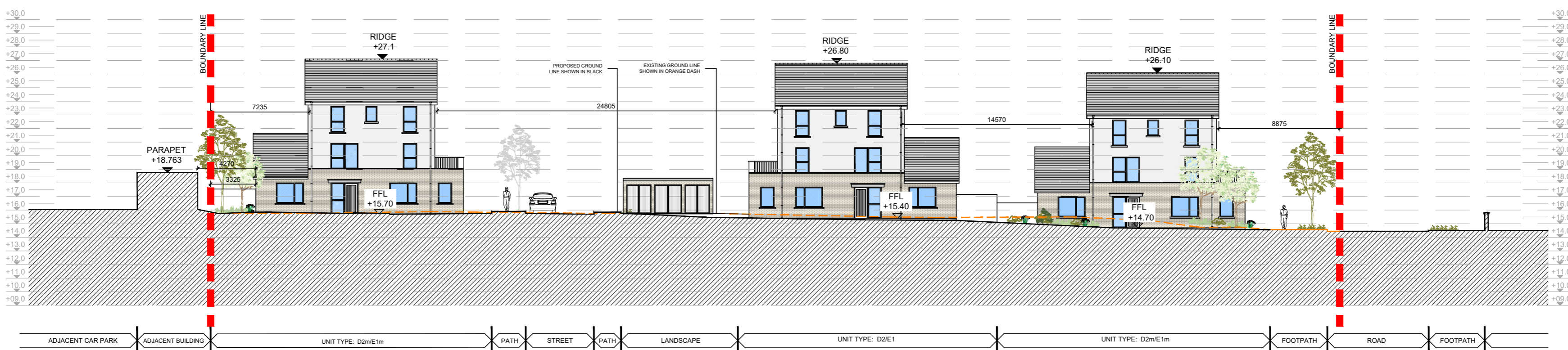
PROPOSED SITE SECTION D-D SCALE 1:250@A2