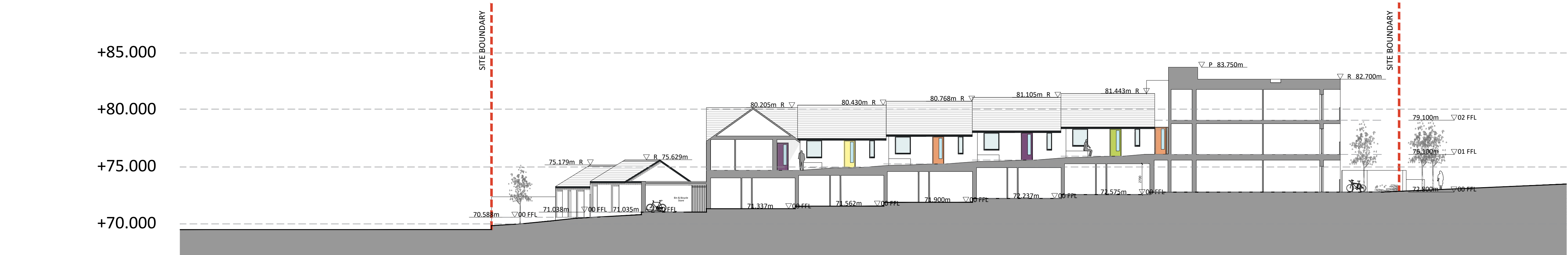
Site Section F-F