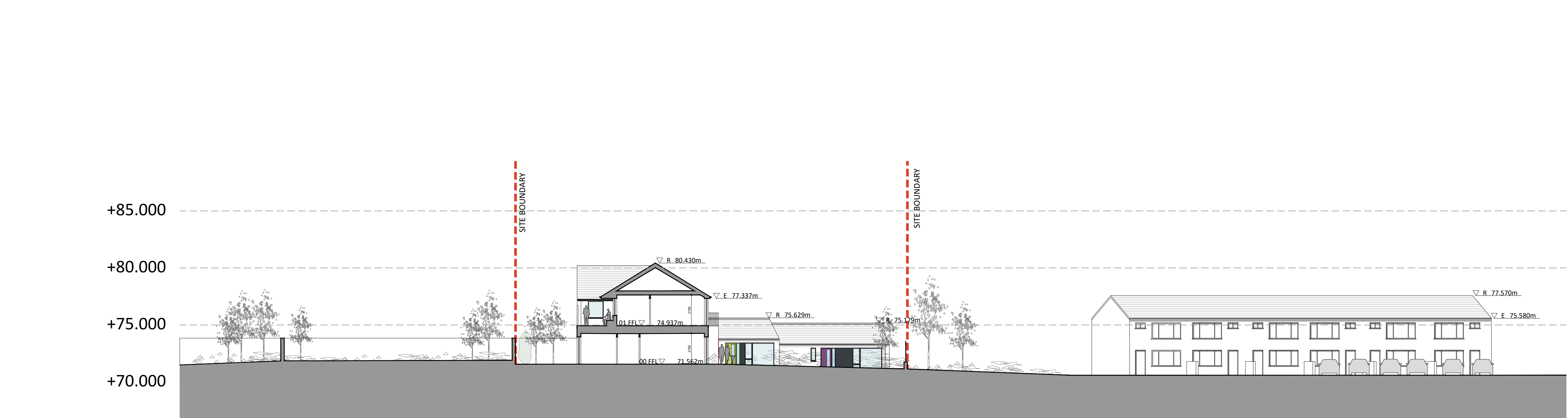
Site Section D-D