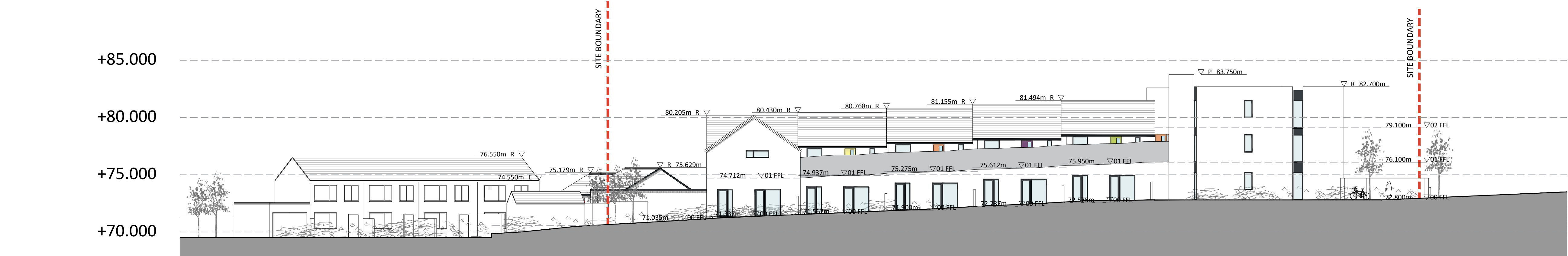
Site Section E-E