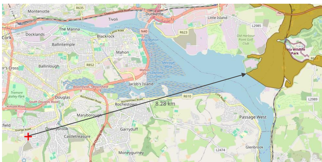
Figure 2 - Location of Subject Site in Relation to Great Island Channel SAC