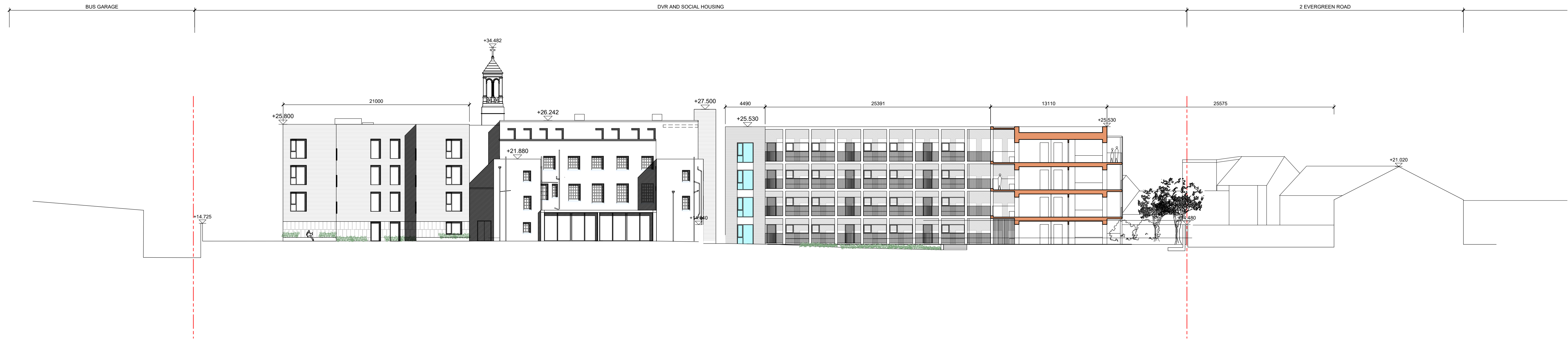
02 PP22 Proposed Site Section B Scale 1:250 @ A1