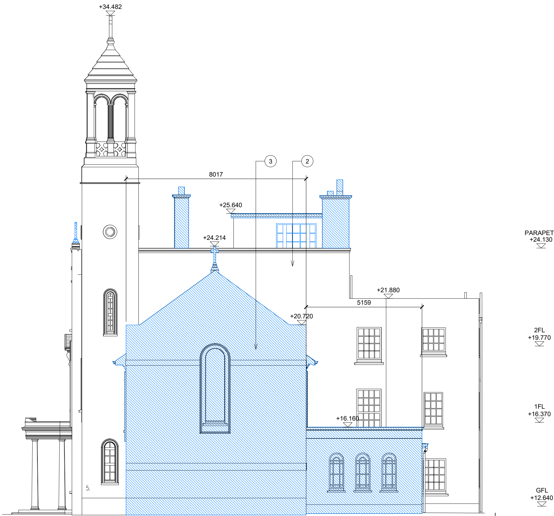
01 PP31 Proposed East Elevation Scale 1:100 @ A1