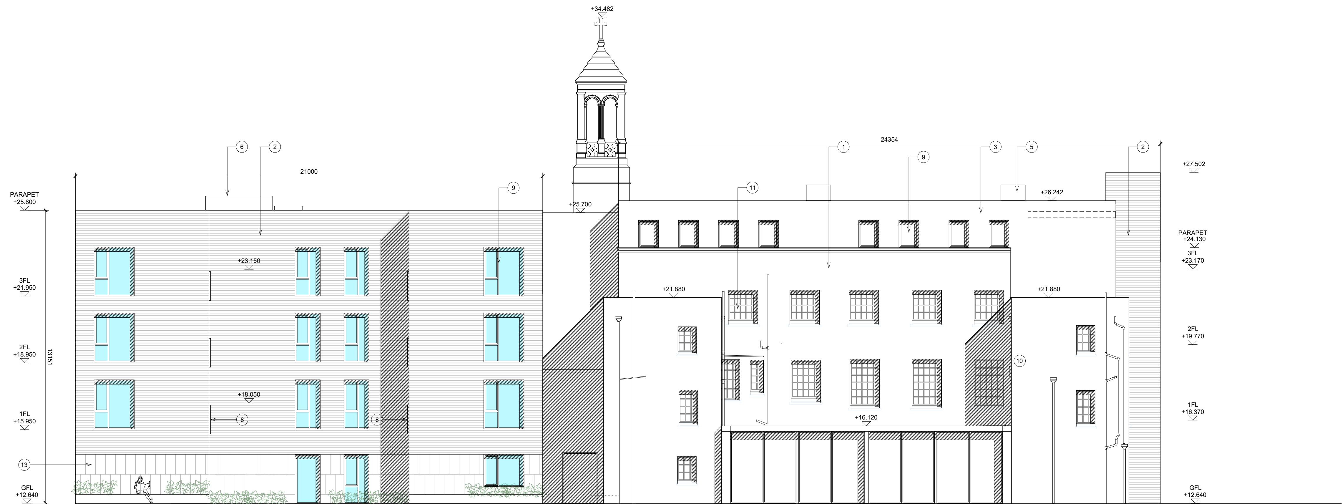
02 Proposed North Elevation PP30/ Scale 1:100 @ A1