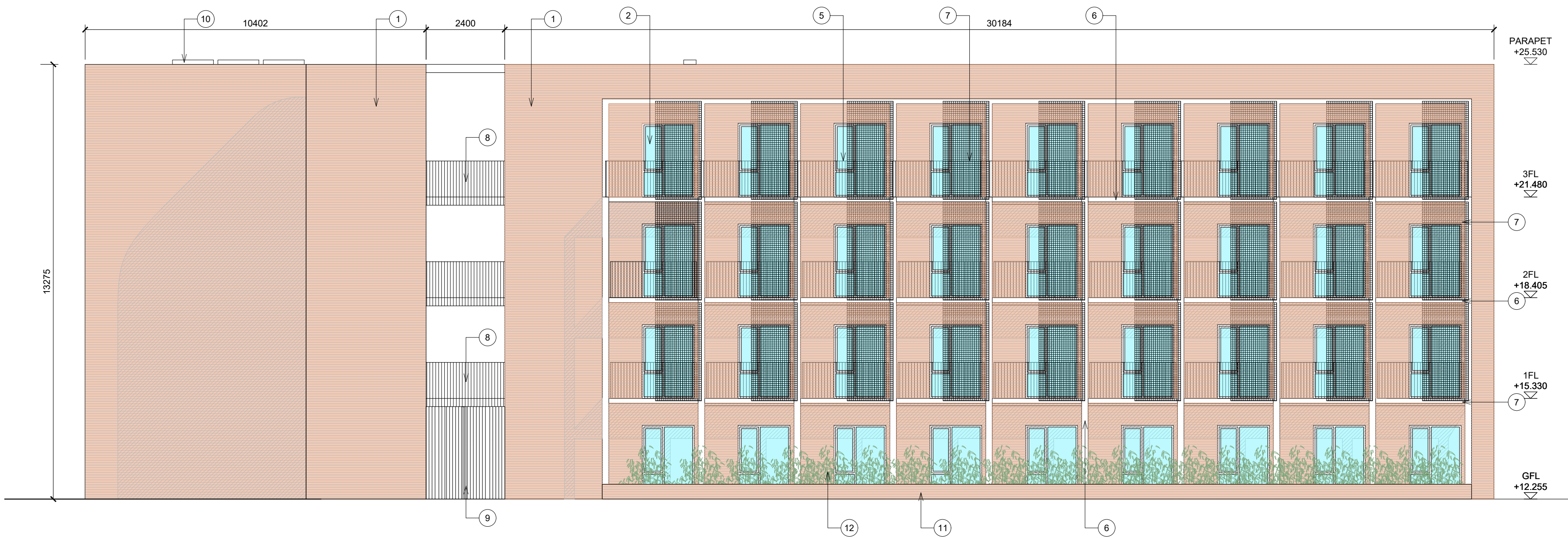
02 WEST BLOCK SOUTH ELEVATION Scale 1:100