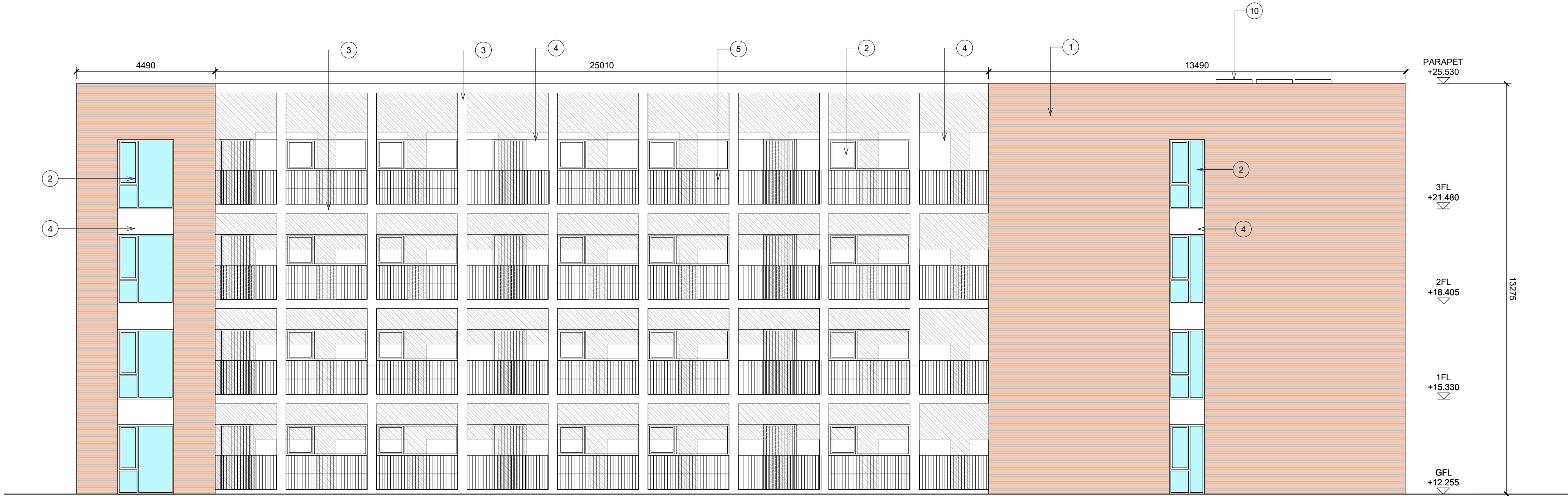
01 WEST BLOCK NORTH ELEVATION Scale 1:100