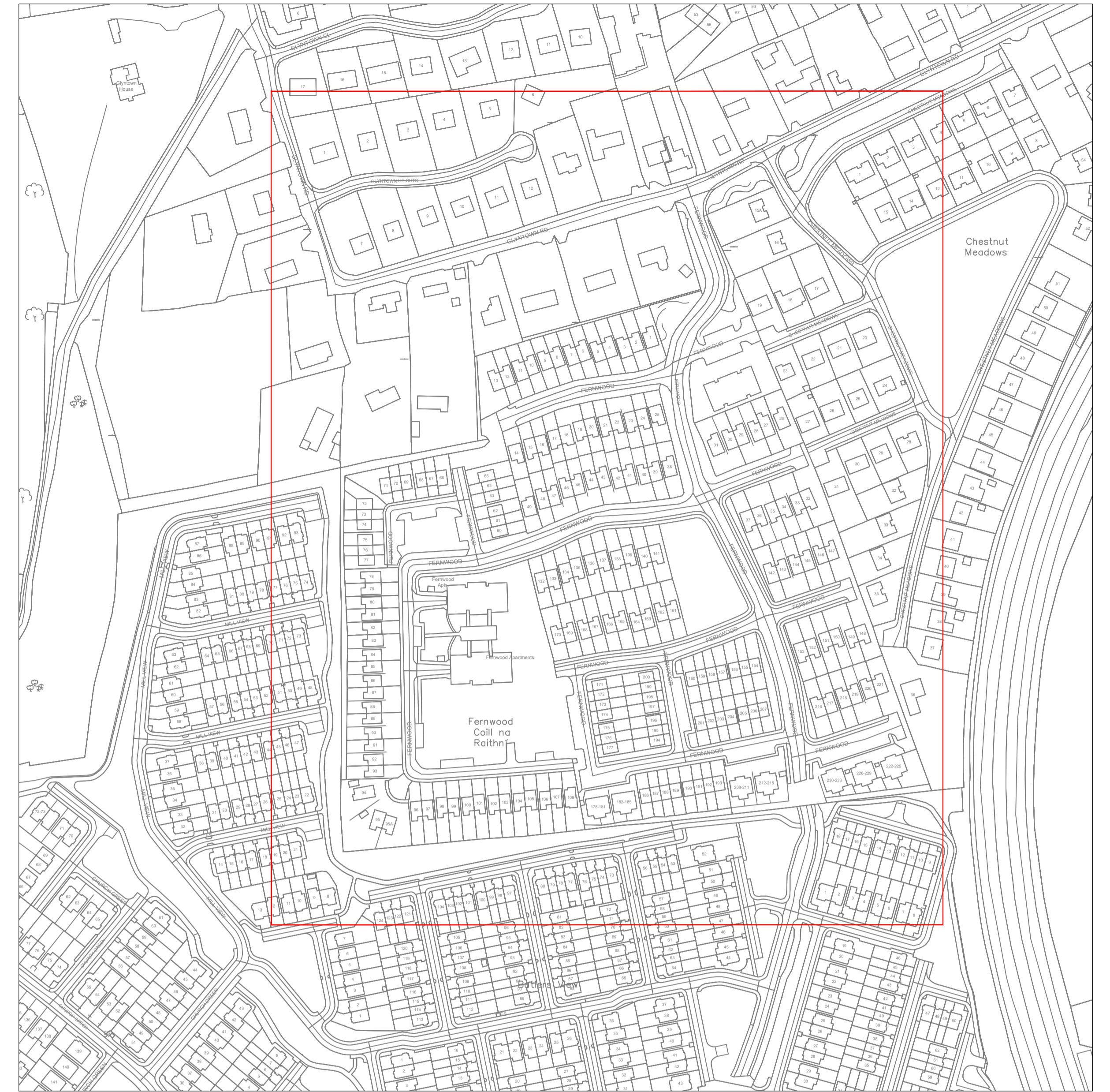
SITE LOCATION MAP 1:2000