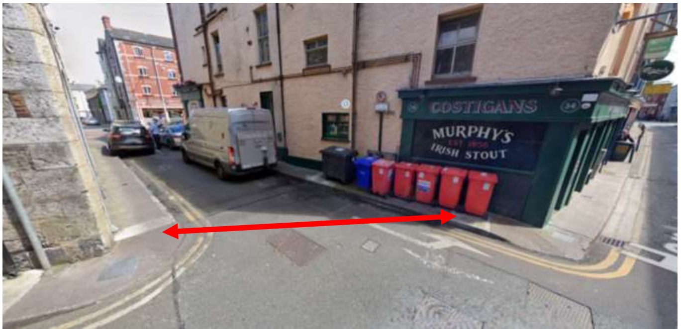
Figure 4: Little Ann Street road closure barrier location at its junction with Hanover Street