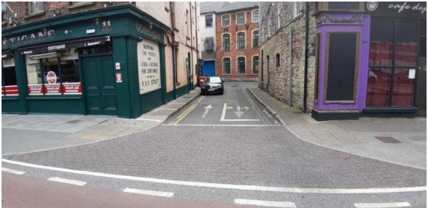
Figure 2: Little Ann Street