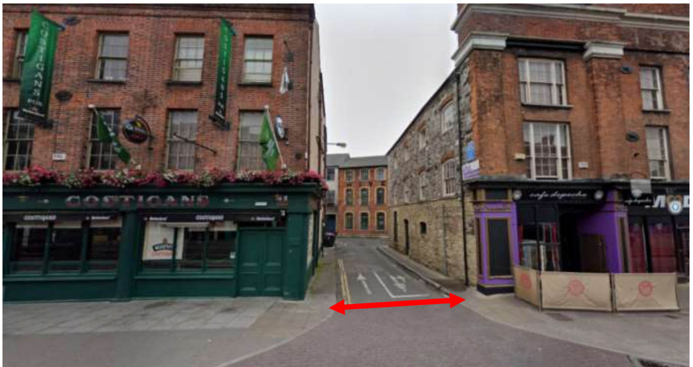
Figure 3: Little Ann Street road closure barrier location at its junction with Washington Street