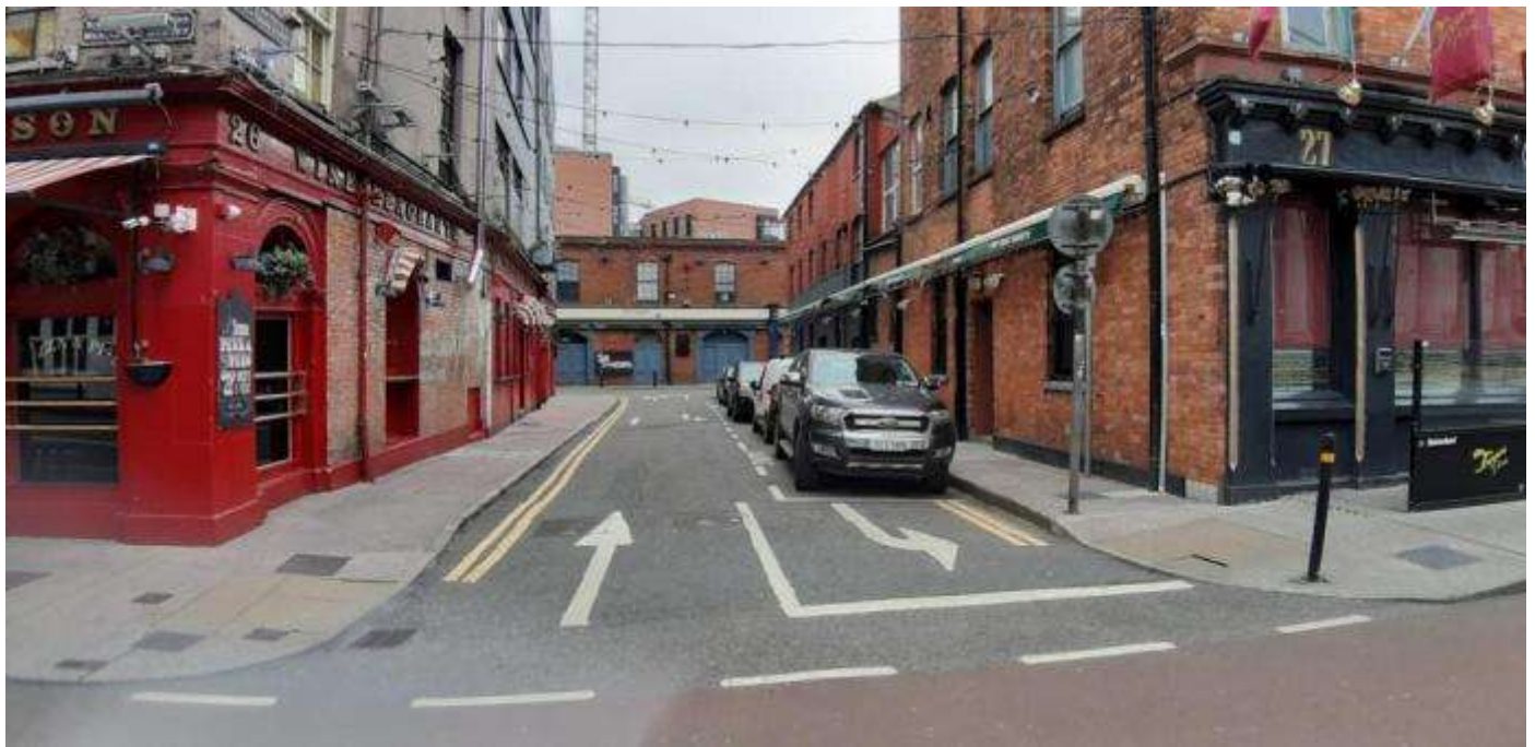
Figure 2: Little Cross Street