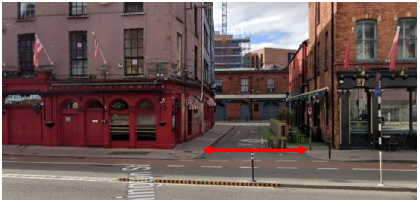
Figure 4: Little Cross Street road closure barrier location at its junction with Washington Street