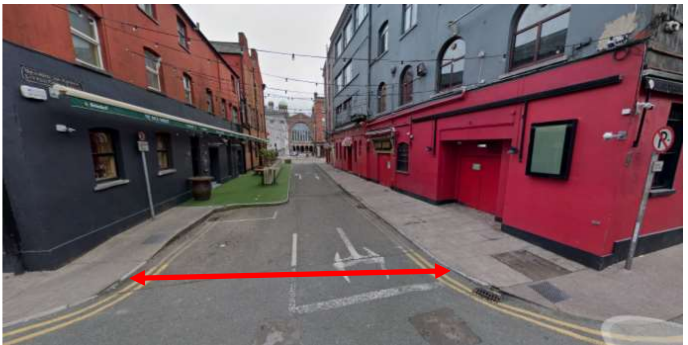
Figure5: Little Cross Street road closure barrier location at its junction with Hanover Street