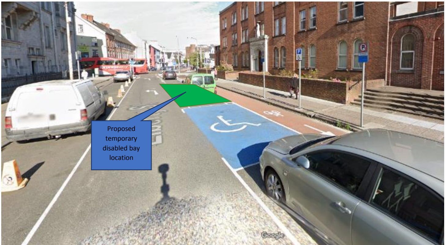
Figure 4: Proposed temporary disabled bay location on Liberty Street West.