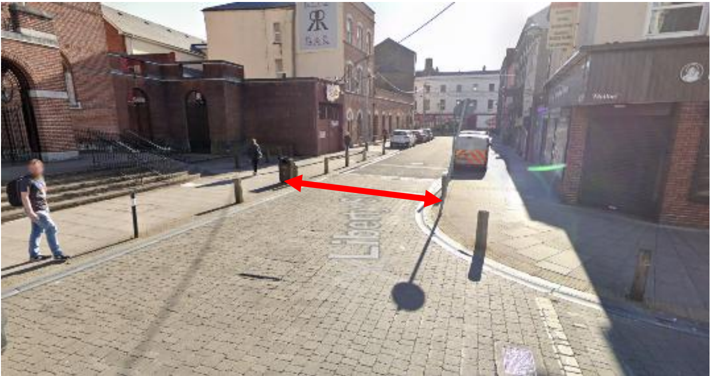
Figure 2: Road closure indicative location at junction with Cross Street