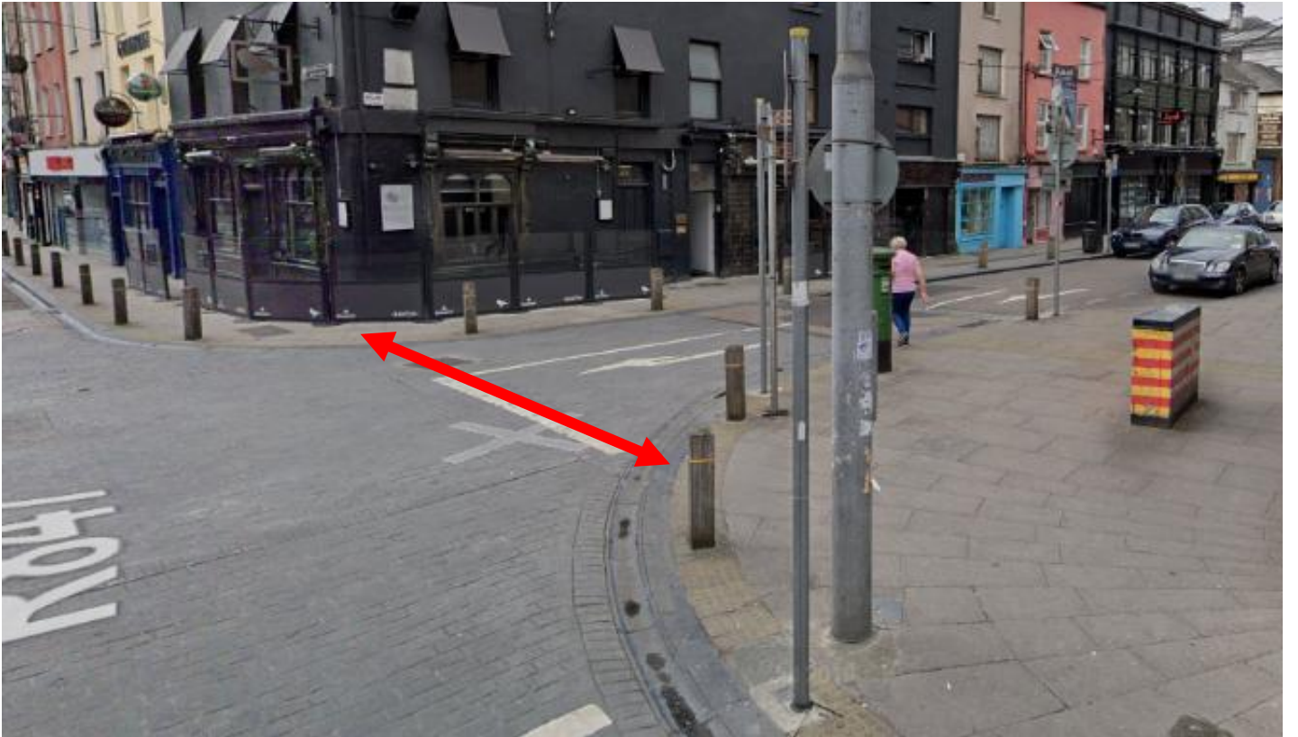
Figure 3: Road closure indicative location at junction with South Main Street/North Main Street