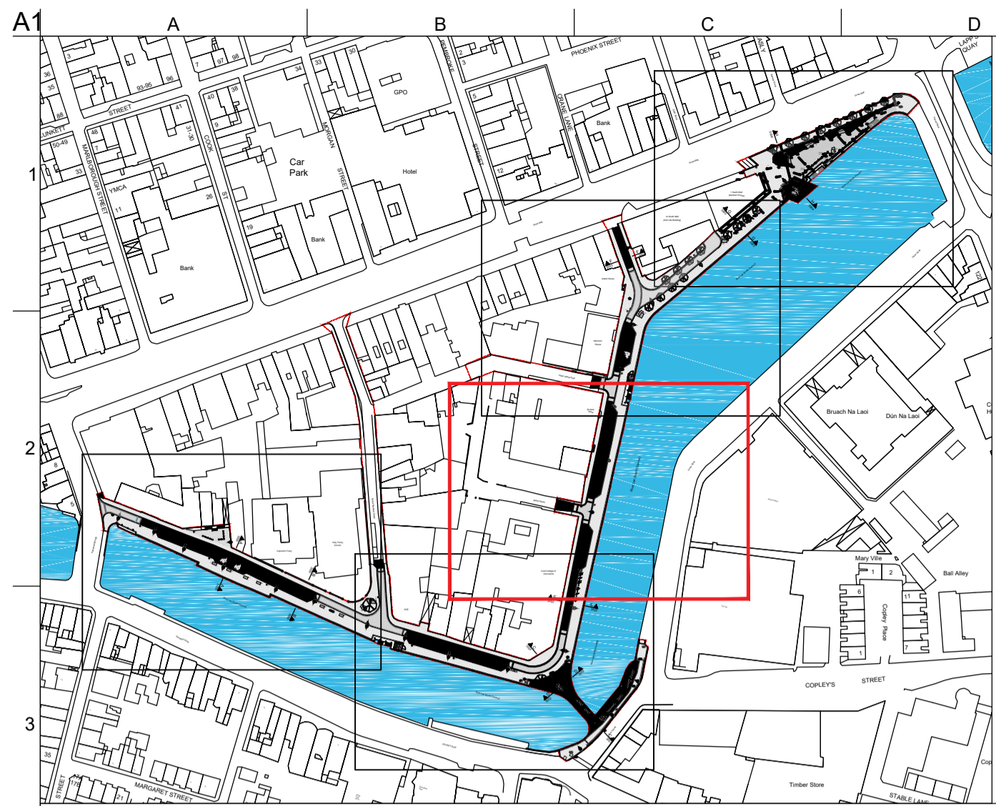
Scheme Locator Plan Scale: 1:2500