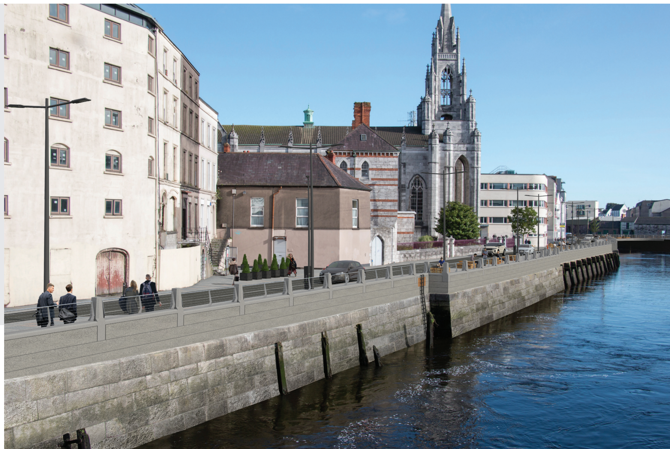
Proposed Lens 5029 OD

All lens levels are adjusted to incorporate proposed regraded levels at camera viewpoint locations.