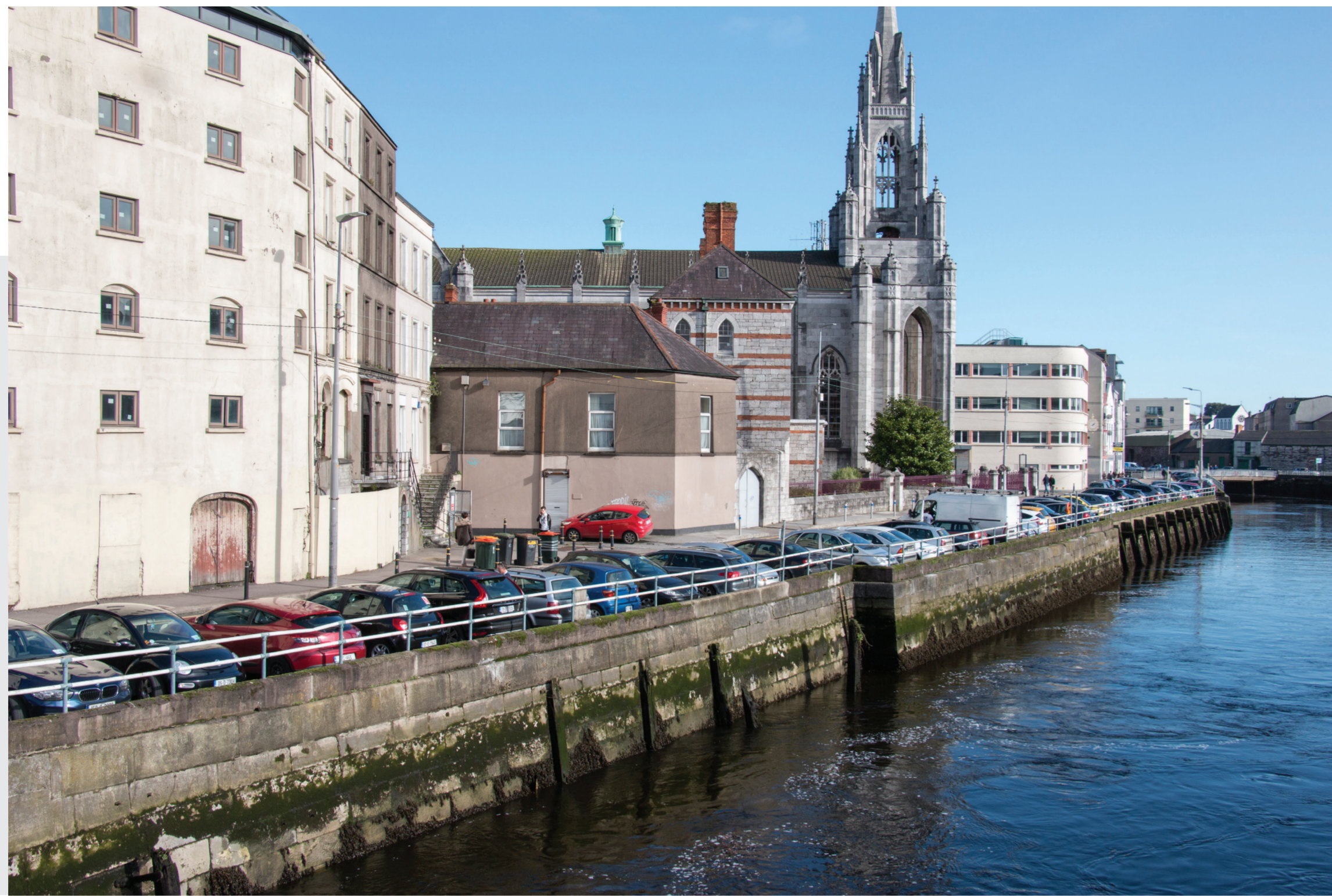
Existing Lens 5029 OD