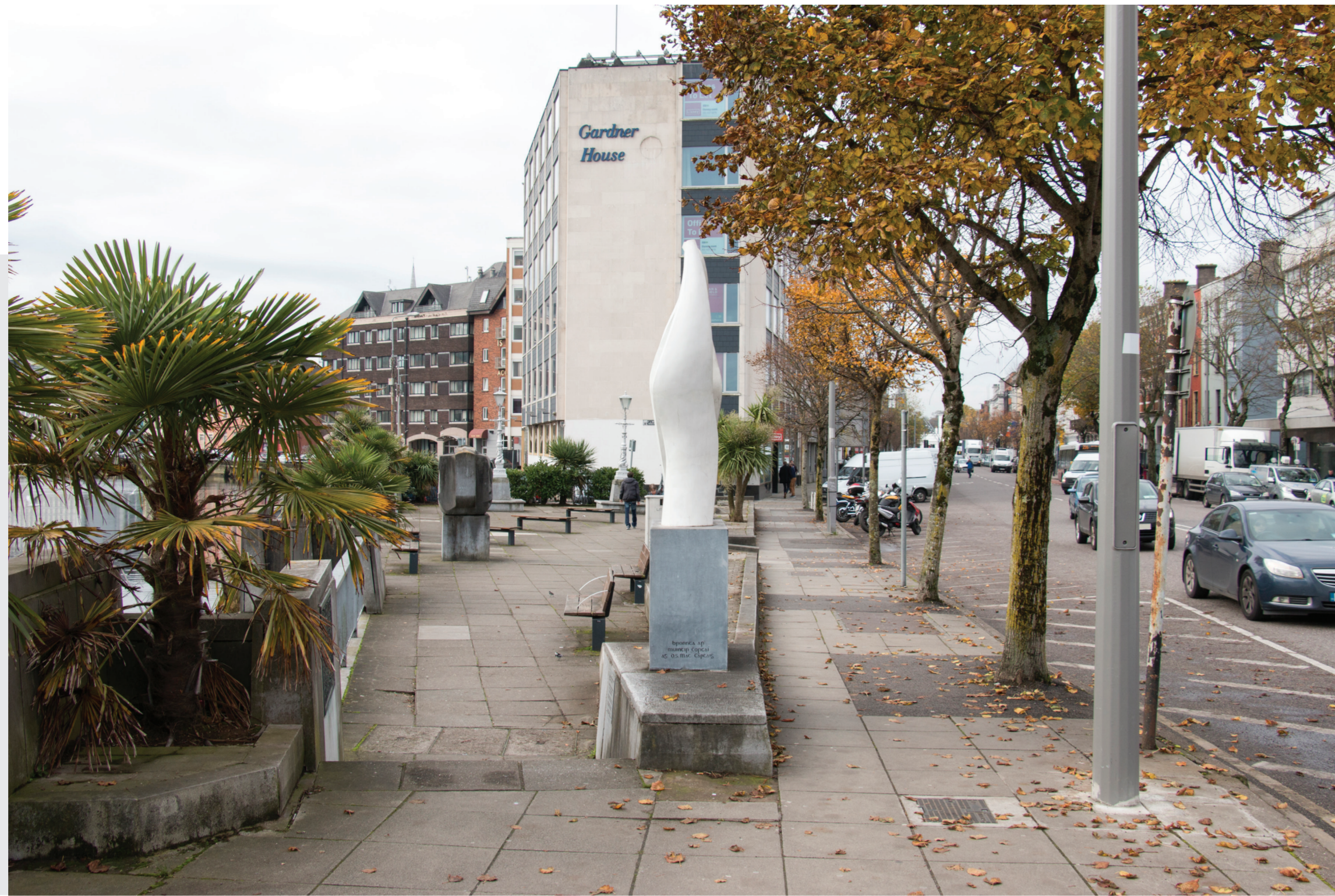
Existing Lens 4911 OD