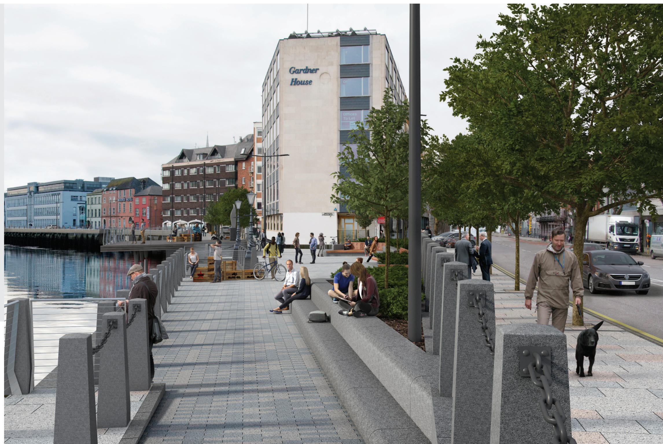
Proposed Lens 5100 OD

All lens levels are adjusted to incorporate proposed regraded levels at camera viewpoint locations.