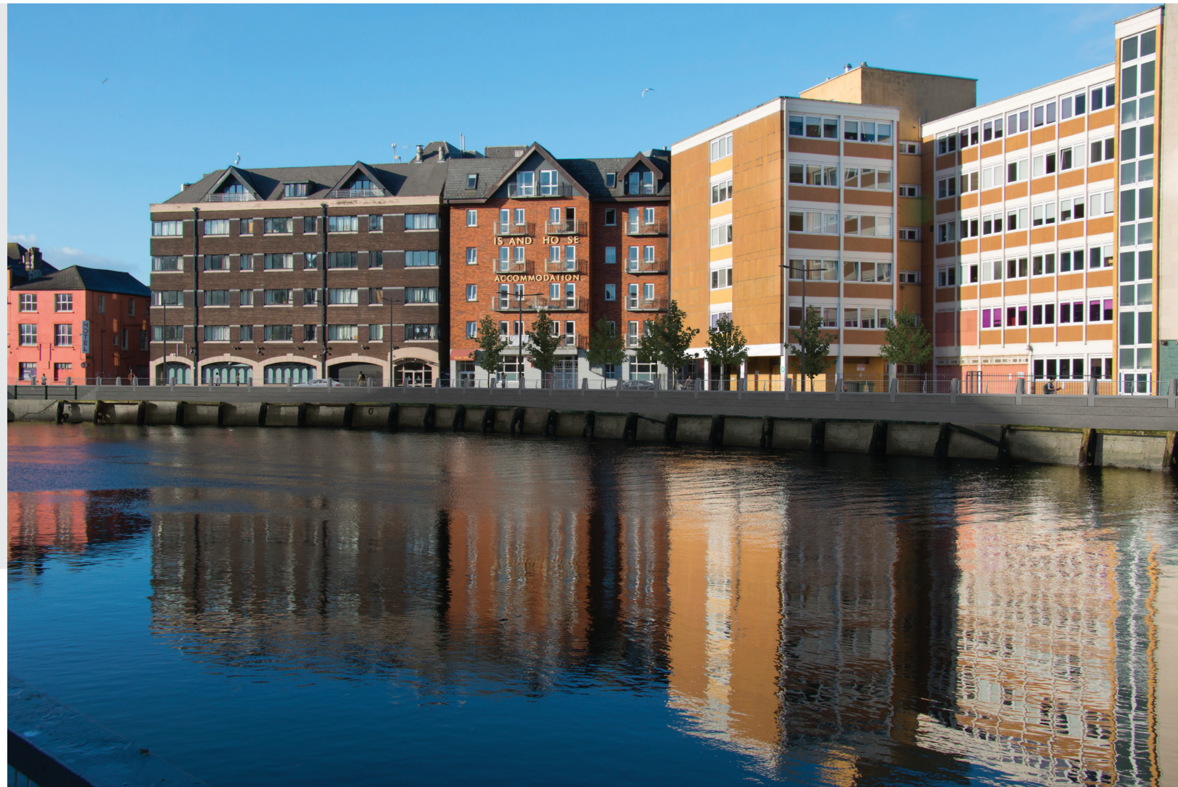
Proposed Lens 4046 OD