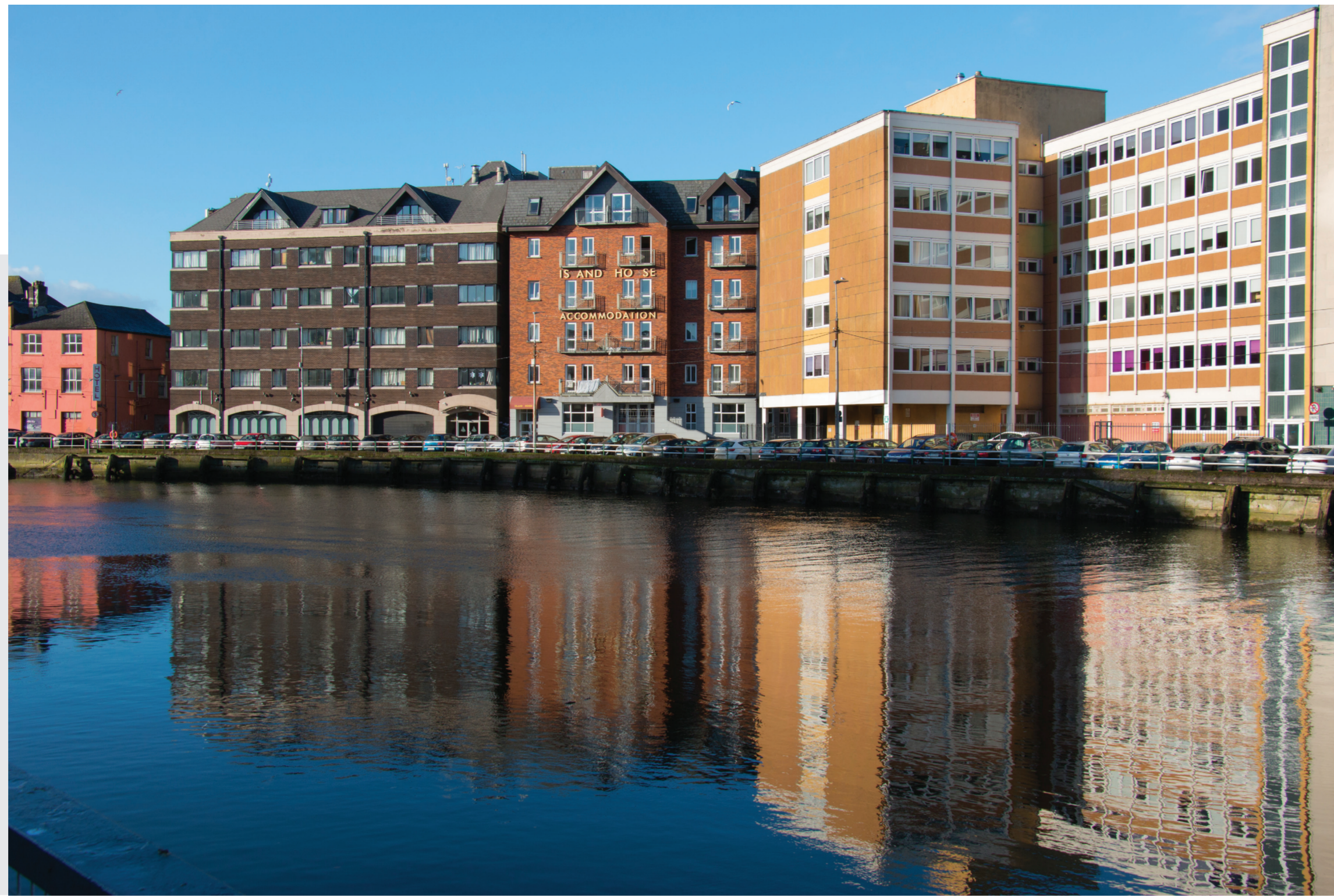
Existing Lens 4046 OD