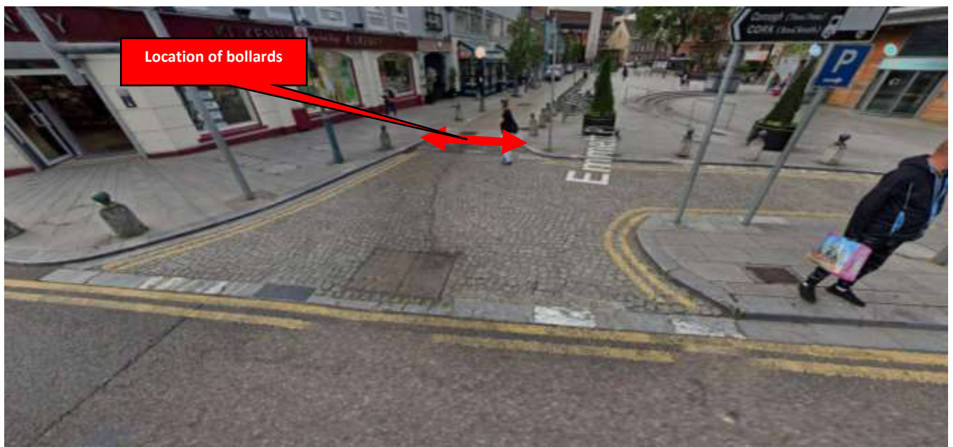
Figure 3: Emmett Place from its junction with Lavitt's Quay.