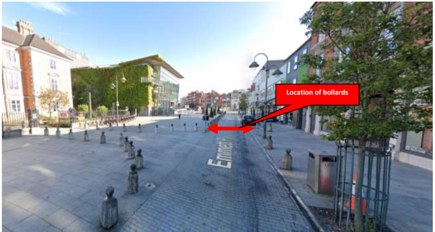
Figure 2: Road closure indicative location at junction with Crawford Gallery car park entrance