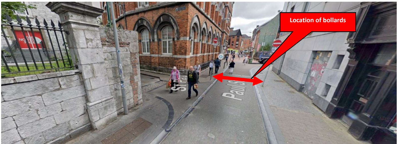
Figure 3: Road closure east of the junction of Paul Street and St. Paul's Avenue