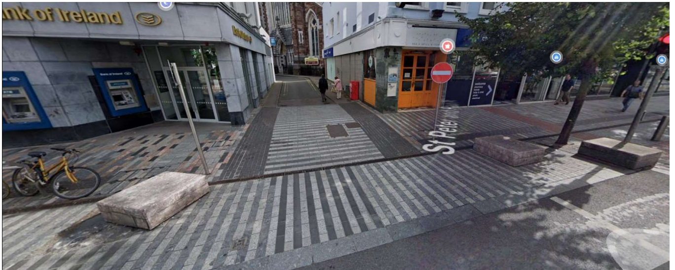
Figure2: Junction of St Peter and Paul's Place and St. Patrick's Street