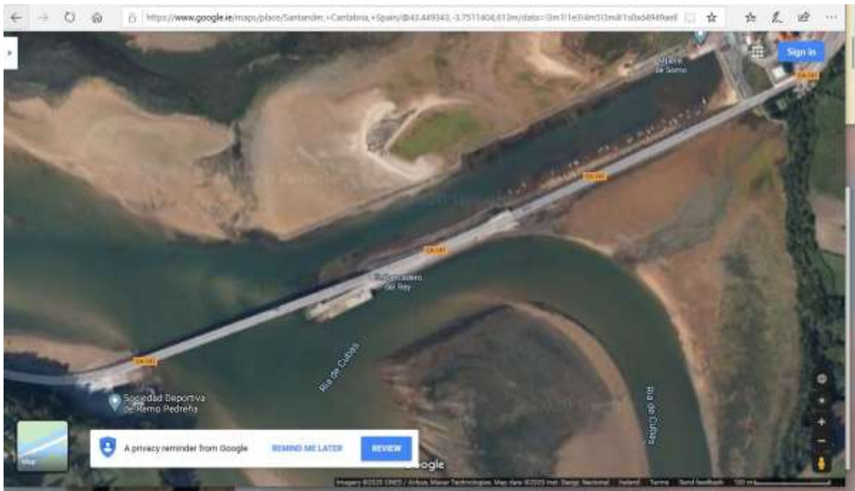
Screenshots from Google maps of the CA-141 Bridge over Ria de Cubas with slipways, Santander