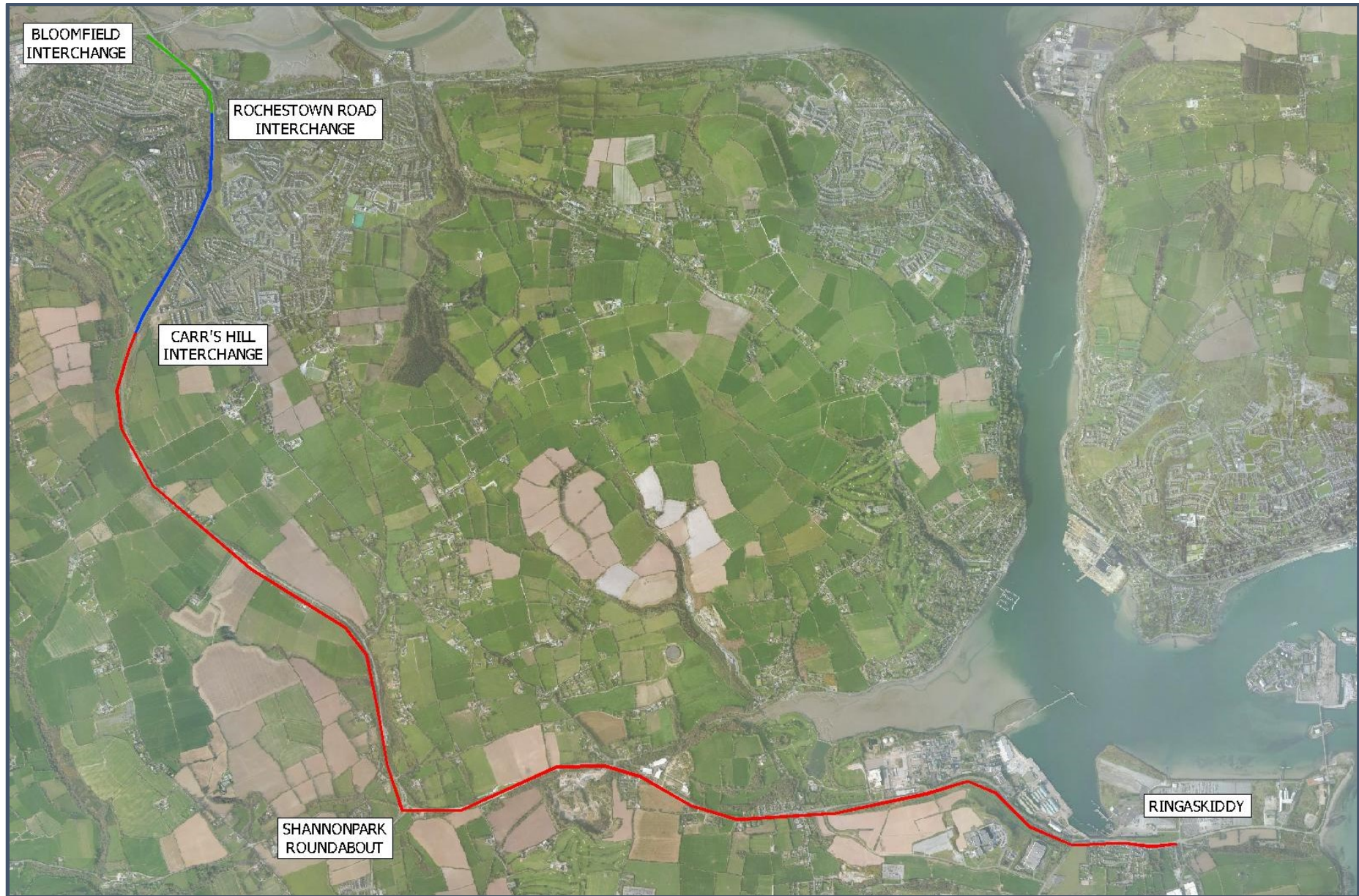
Figure 1 Existing N28 Corridor