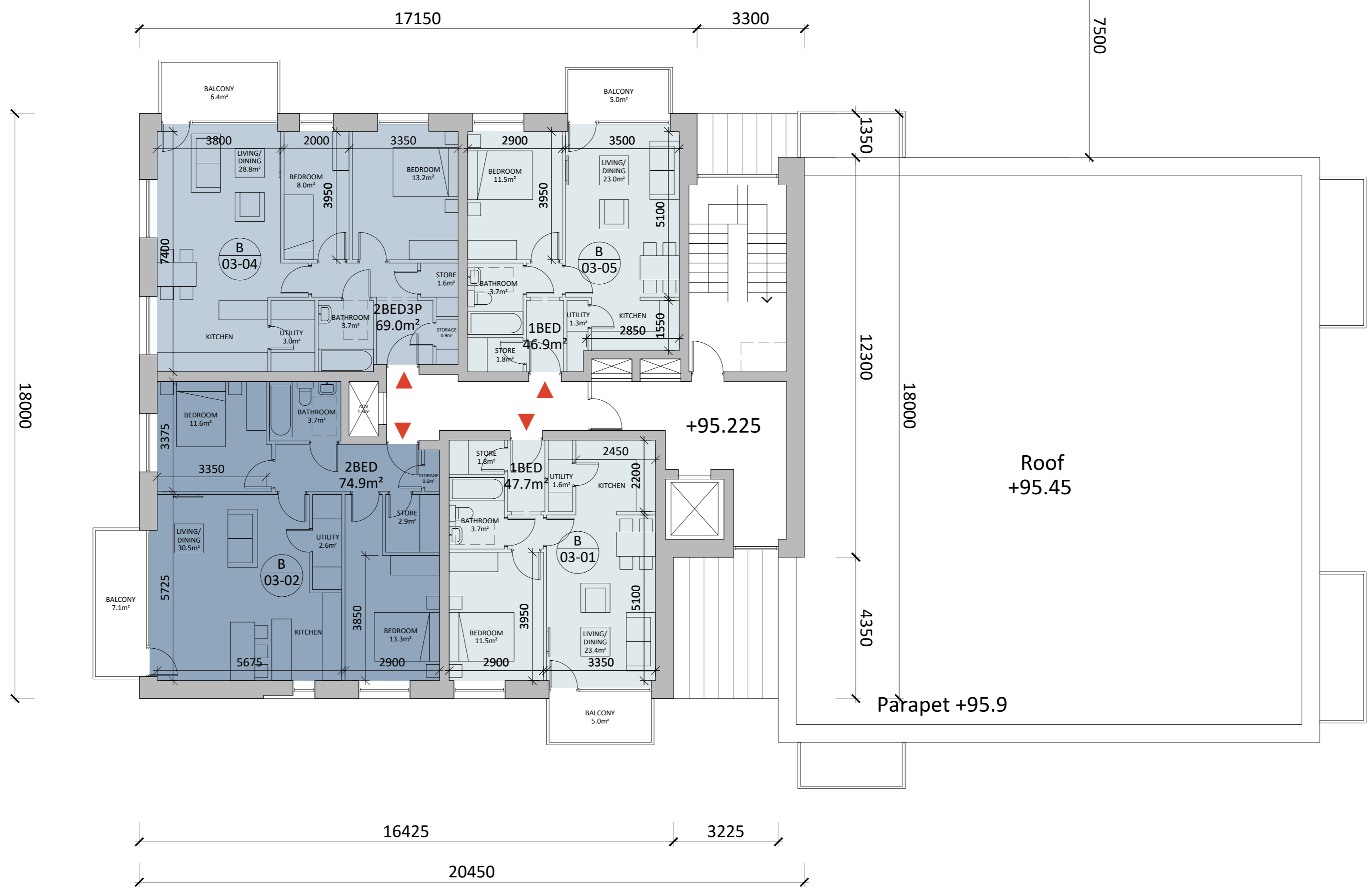
Level 03 Plan